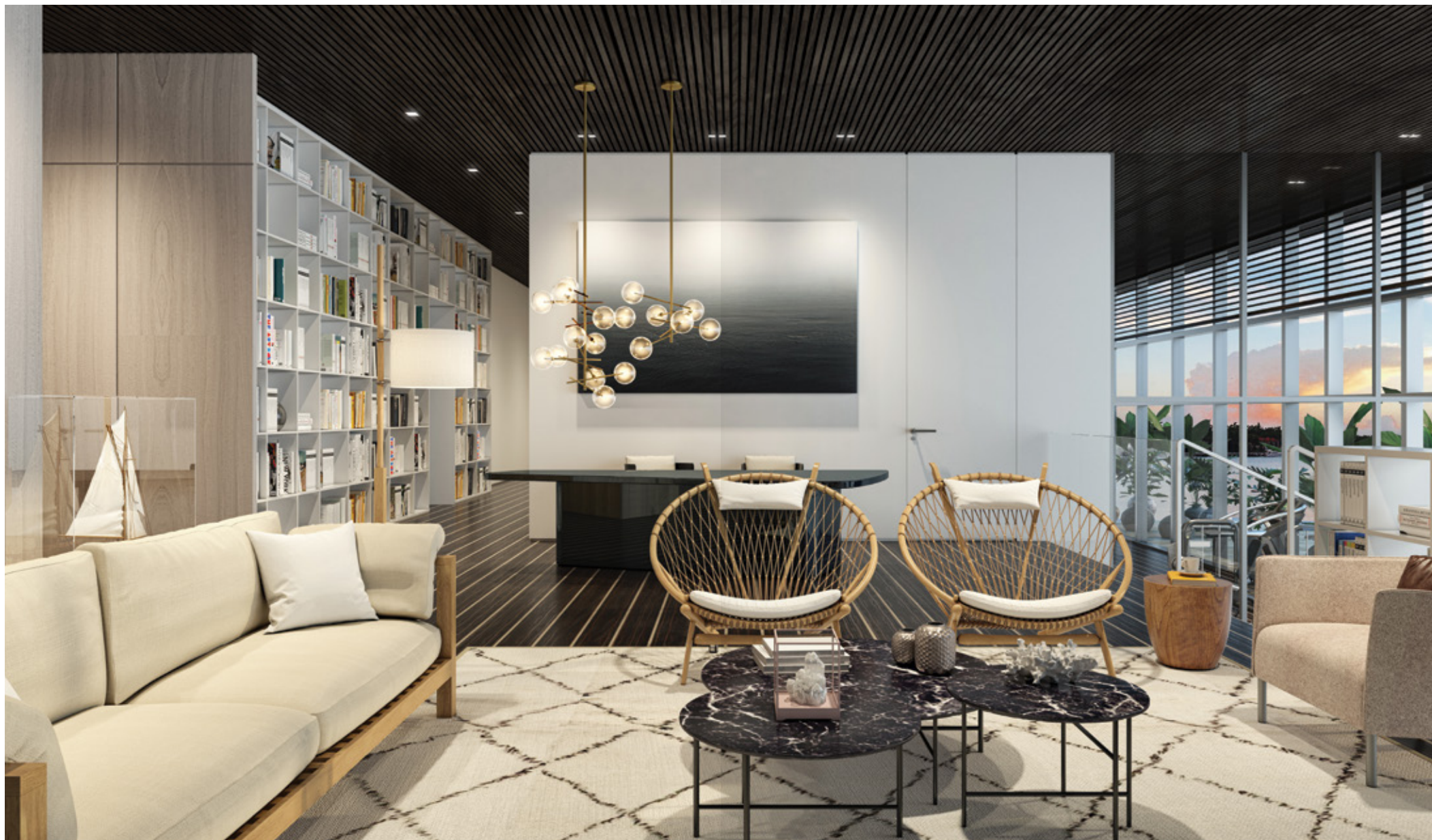
Côte d'Azur-inspired reception and lobby areas, curated by Lissoni®