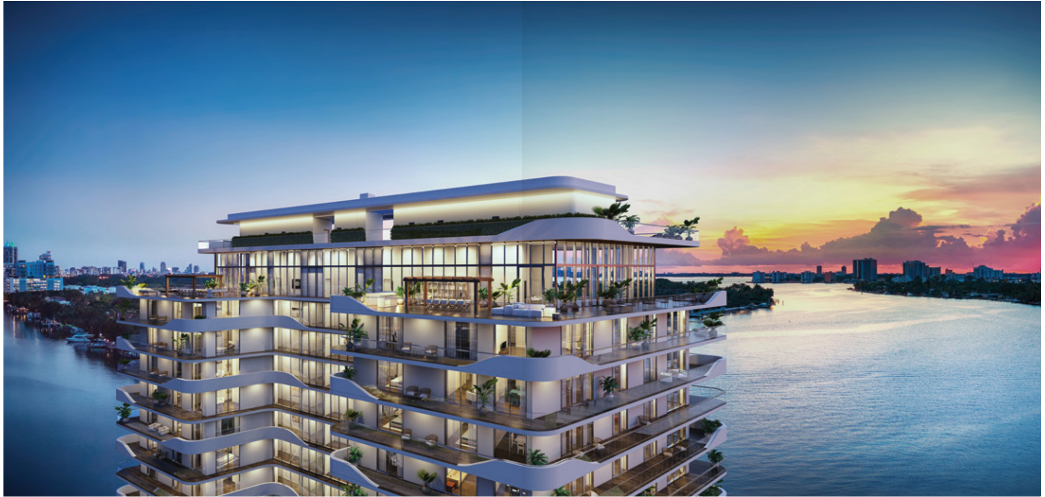
Two half-floor penthouses feature expansive wrap-around, rooftop terraces framing panoramic views of Biscayne Bay and the Atlantic Ocean.