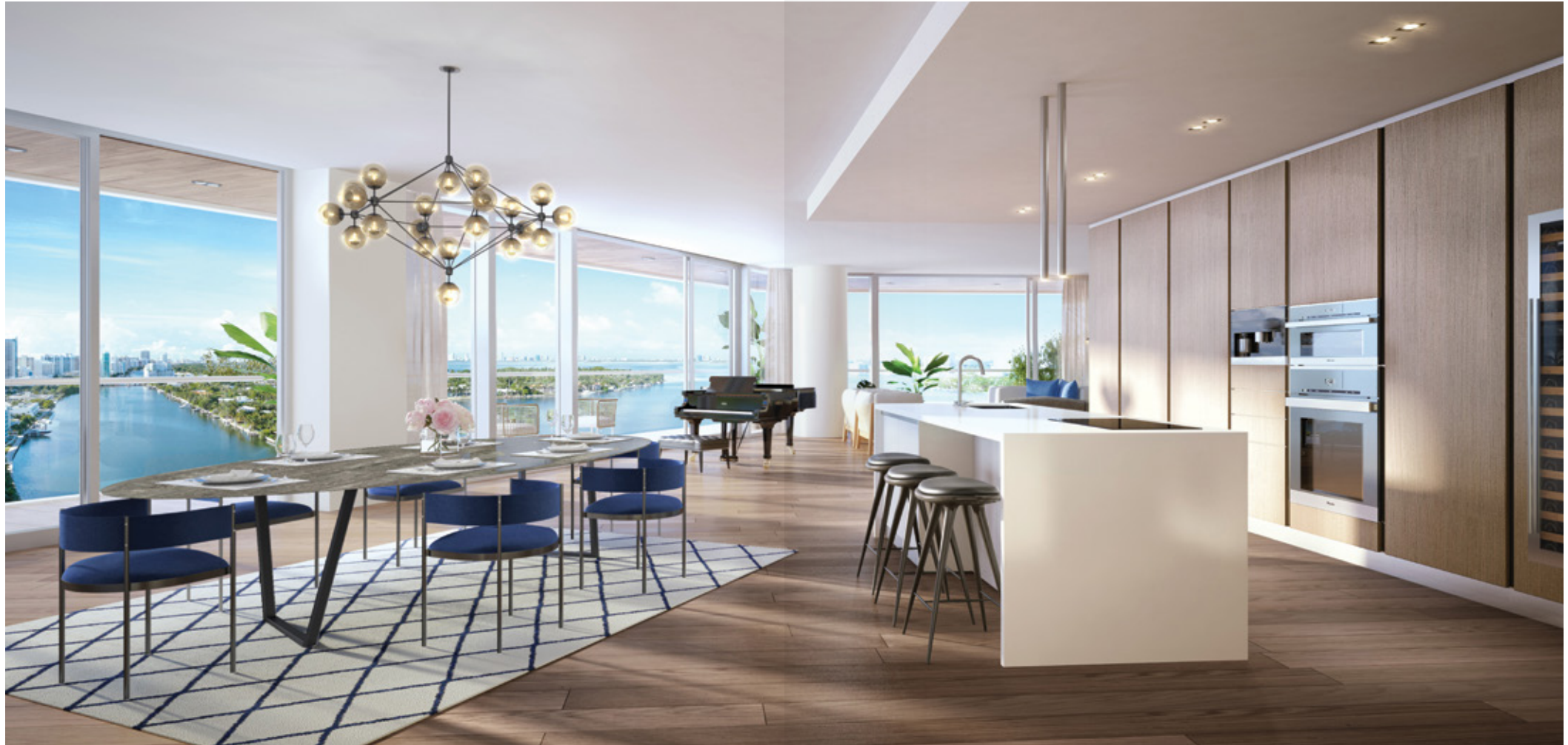
Boffi® contemporary, Italian kitchens feature imported stone countertops and Miele® appliances including built-in coffee maker and wine storage.