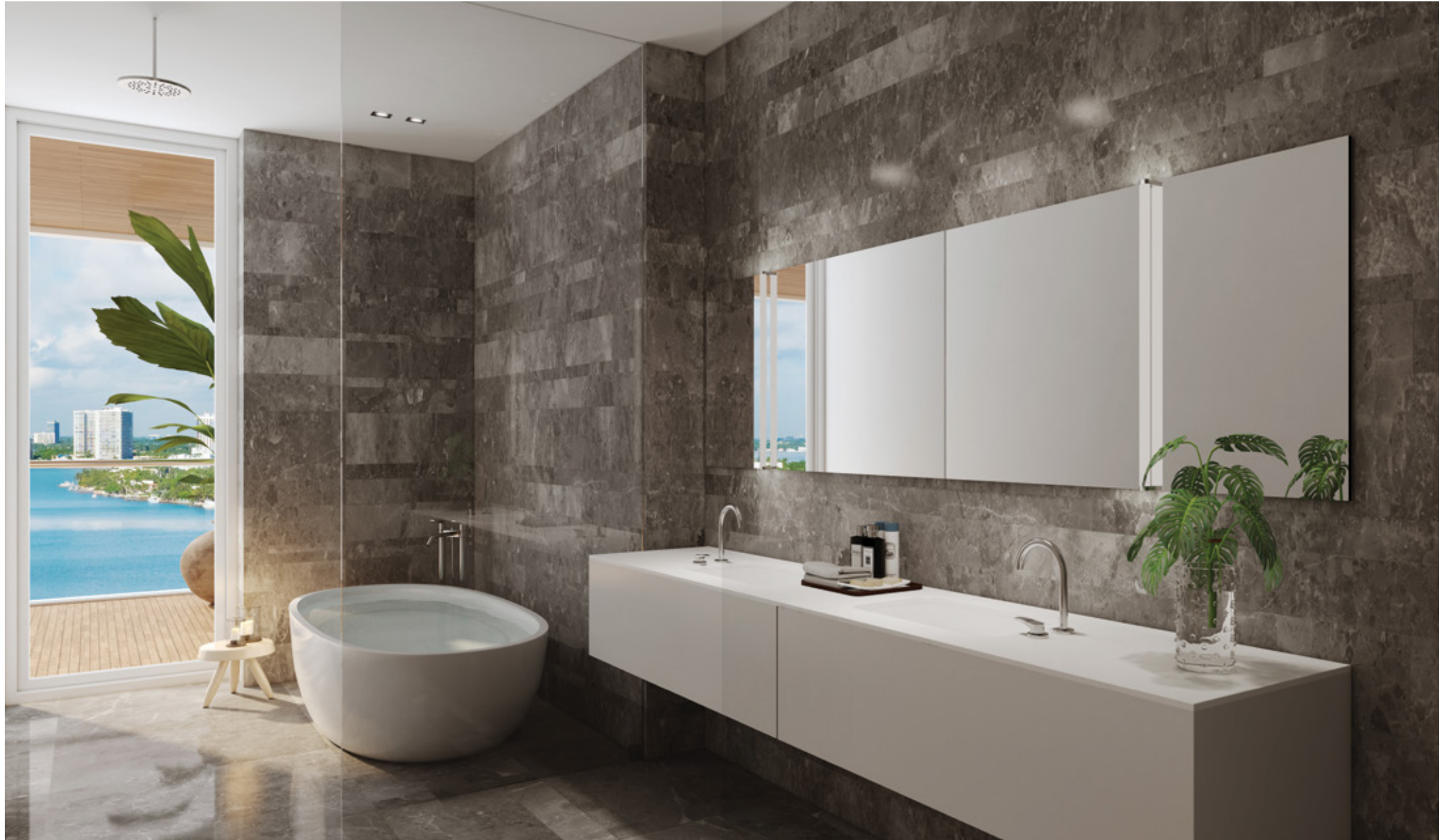
Deep soaking tubs, frame-less glass wet rooms, rain shower heads and imported marble flooring and walls bring quiet tranquility to master bathrooms.