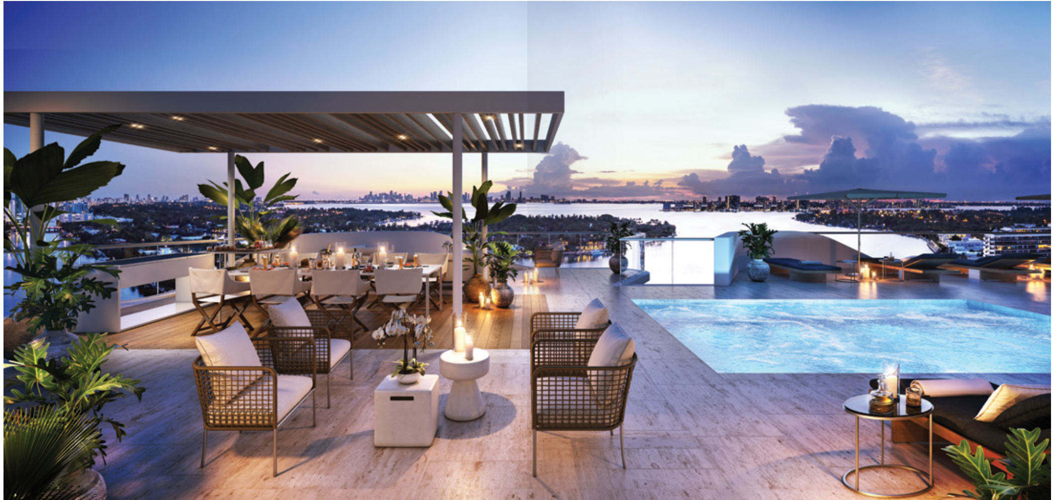
Rooftop pool, jacuzzi and sun deck with private lounging areas feature an outdoor grill and chef's table for entertaining.