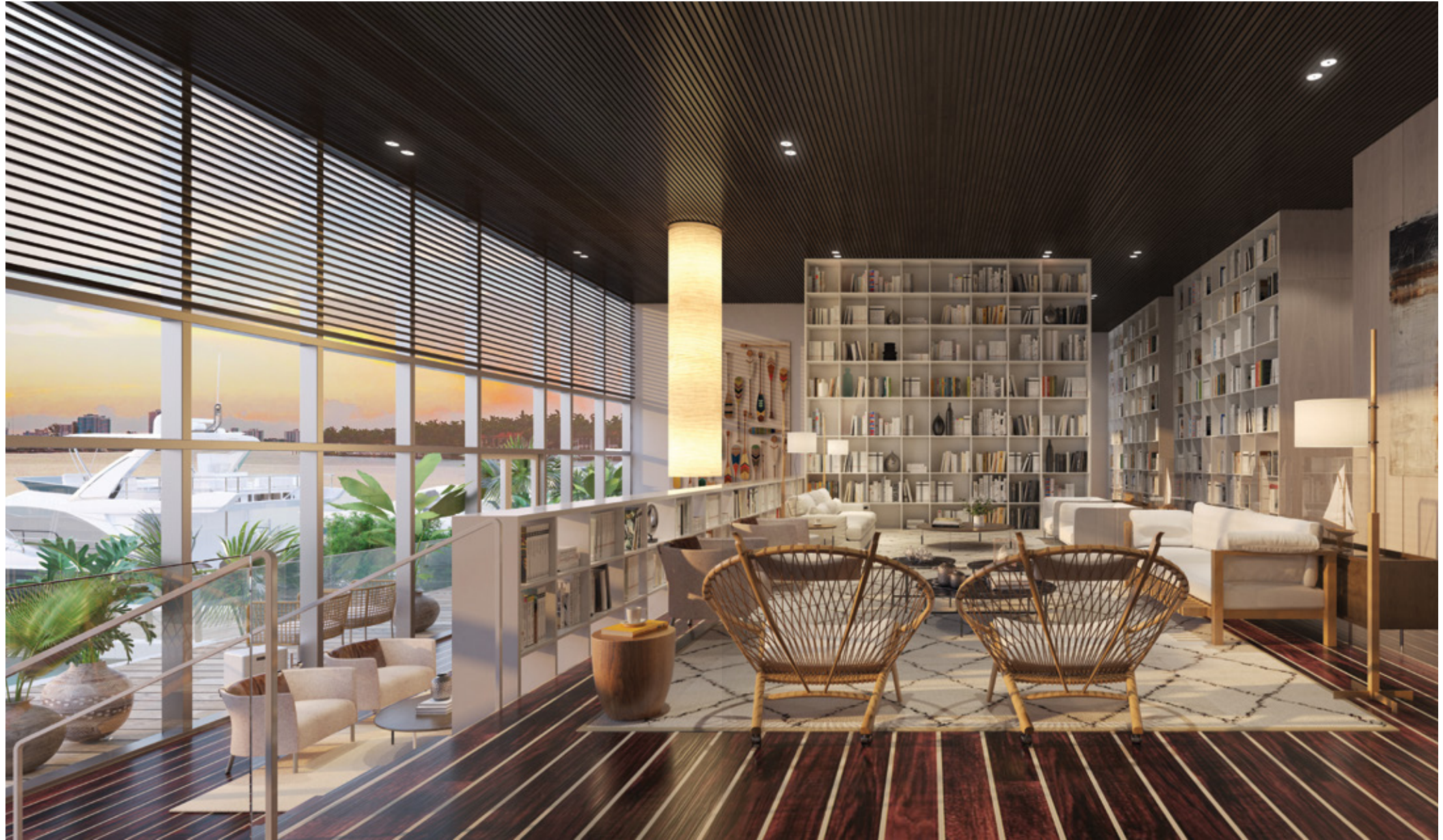
Floor-to-ceiling windows in the double-height lobby frame sweeping views of the Intracoastal and private marina.