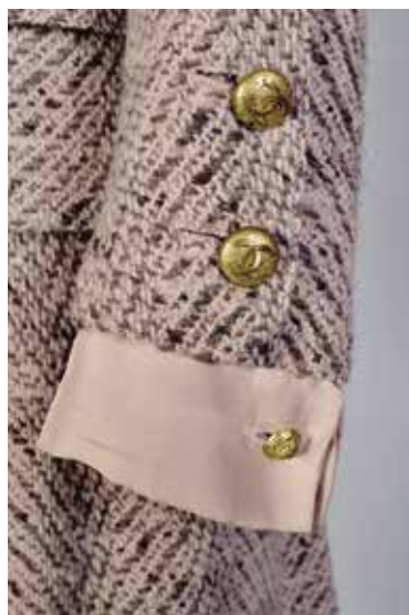
Gabrielle Chanel for House of Chanel, 1960-1969.