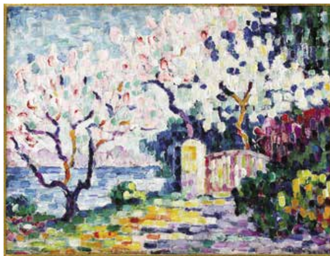
Paul Signac, Flowering Almond Trees , 1896.

Born in Argentina and raised in Paris, the late philanthropist Georges Bemberg assembled an outstanding art collection now housed in a Renaissance mansion in Toulouse. Some 90 paintings and works on paper make a stateside appearance in Monet to Matisse: Impressionism to Modernism from the Bemberg Foundation offering a star-studded survey of late 19 th - and early 20 th -century French art. June 27 through Sept. 19 at the Museum of Fine Arts, Houston; mfah.org .