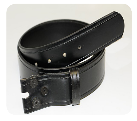
Military Police Belt: 9 oz. black leather, creased, 1 3/4 " wide, no buckle

For questions or to learn more about leather manufacturing services, contact us at: Stone Belt • 2815 East Tenth Street • Bloomington, IN 47408 • 812.332.2168 • www.stonebelt.org