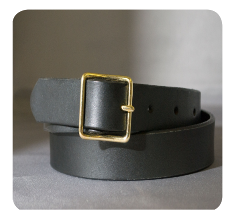
Dress Belt - polished brass buckle, dull black resin finish, 8-9 oz. leather thickness, 1" wide.