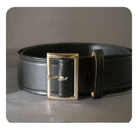
Officer Garrison Belt - Nickel plated buckle, crease border, dull black resin finish, 8-9 oz. leather thickness. 1 ½" wide