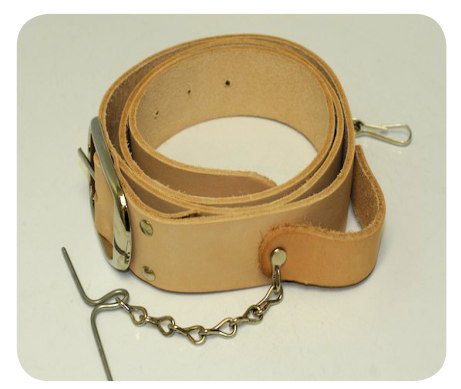
Tool Belt: 9 oz. natural leather

Trooper Garrison Belt - Black hook and loop Velcro material closure, basket weave, border crease design, dull black resin finish, 8-9 oz. leather thickness, 1 1/2 " wide