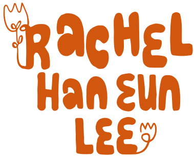
ILLUSTRATION + DESIGN