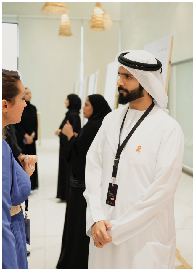
The National Multiple Sclerosis Society Team

Looking ahead at 2025, we stand on the brink of a new era in MS care and empowerment—one defined by global collaboration, deeper community engagement, and a steadfast commitment to achieving real progress for people living with MS.