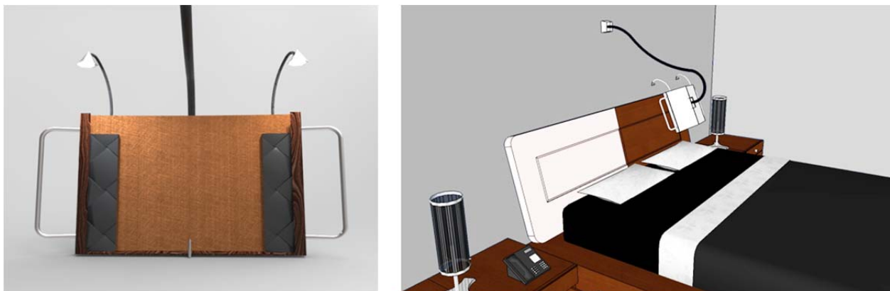
Figure 2. Example of a student project from the Coursera design course.

One might hypothesize that SuperText would be limited to structured and analytical course content and thus would be inferior in tackling complex or loosely structured domains. This may have been true of early efforts at distance learning when content was broadcast via television or distributed in the mail. However, the recent developments in technologies supporting online communities enable rich, unstructured interaction among students. Figure 2 shows an example of a course project from our Coursera class on design — hardly an outcome of rote learning. Similarly, our operations class engaged students with projects related to their jobs, and the outcomes impressed students and faculty alike. Moreover, the asynchronous and remote technology allows participants to engage with SuperText while being employed at work. Instead of faculty writing up business situations in the form of case studies and bringing them to the classroom as documents, SuperText challenges the boundaries between class time and professional life.