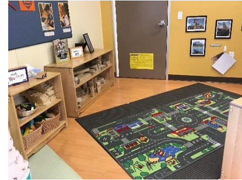
Art Smart Construction Area