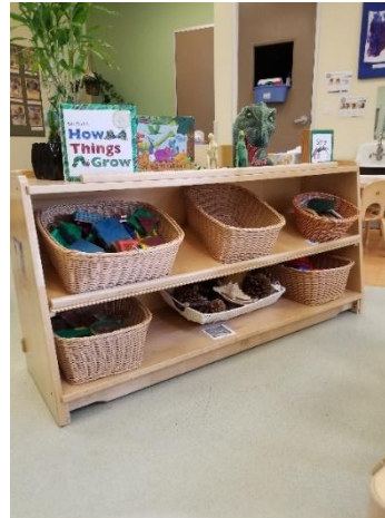
Science Rocks Discovery Area