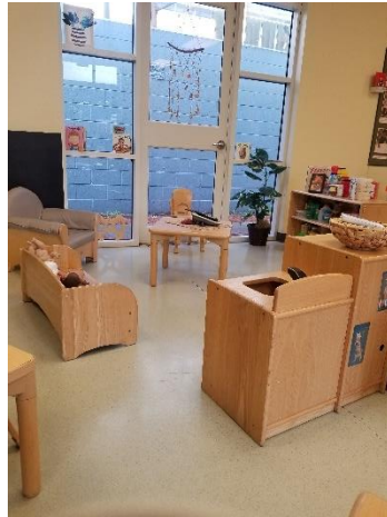
Art Smart Dramatic Play Area