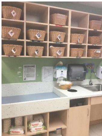
Infant/Toddler diaper changing area