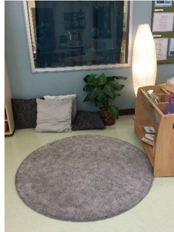
Language Works Classroom Library