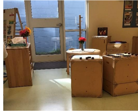
Art Smart Dramatic Play Area