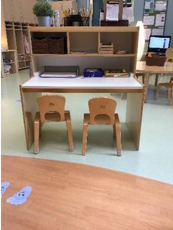
Language Works Writing Center