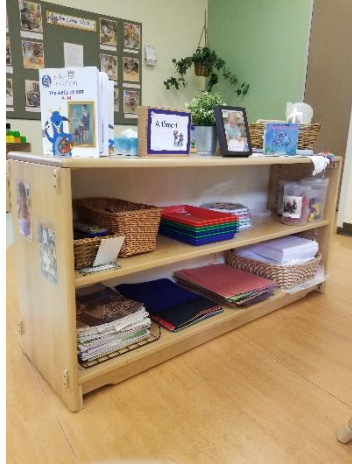
Art Smart Visual Arts