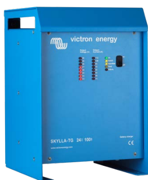
Skylla TG 24 100