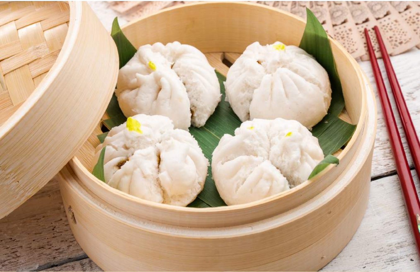
CHICKEN BUNS 38