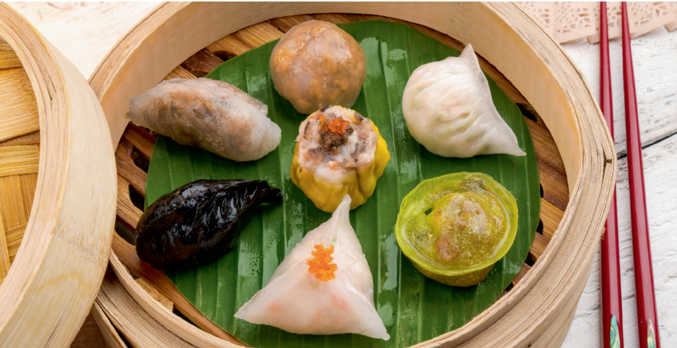
ASSORTED STEAMED DIM SUMS (7 PCS) 59