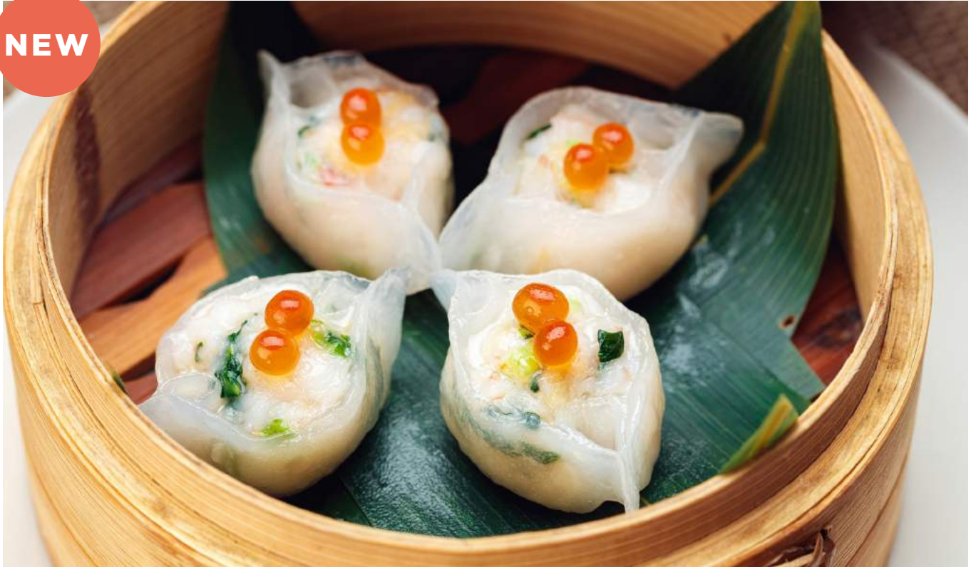
SHRIMP & PAK CHOY DUMPLINGS