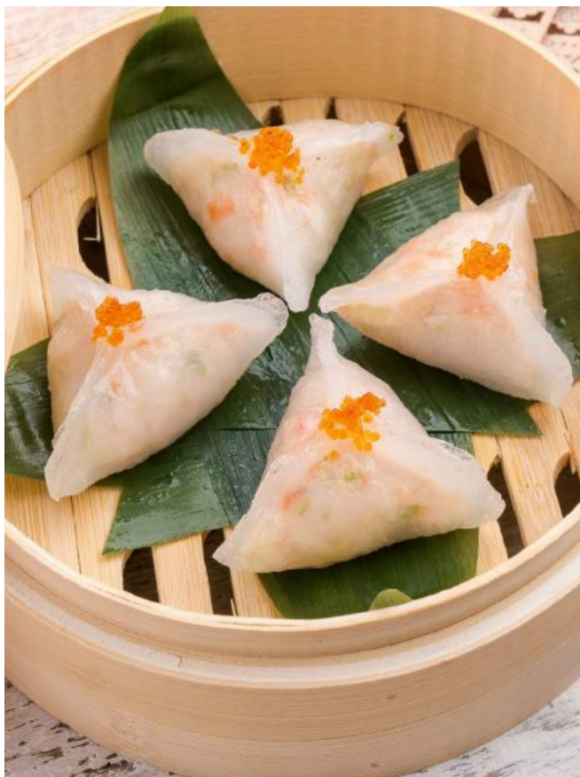
SHRIMP & CRAB DUMPLINGS 32