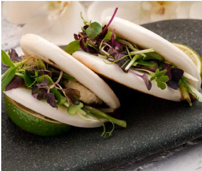
STEAMED TOFU BUNS