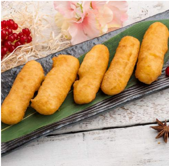
CRISPY MILK WITH TOFFEE CREAM 35