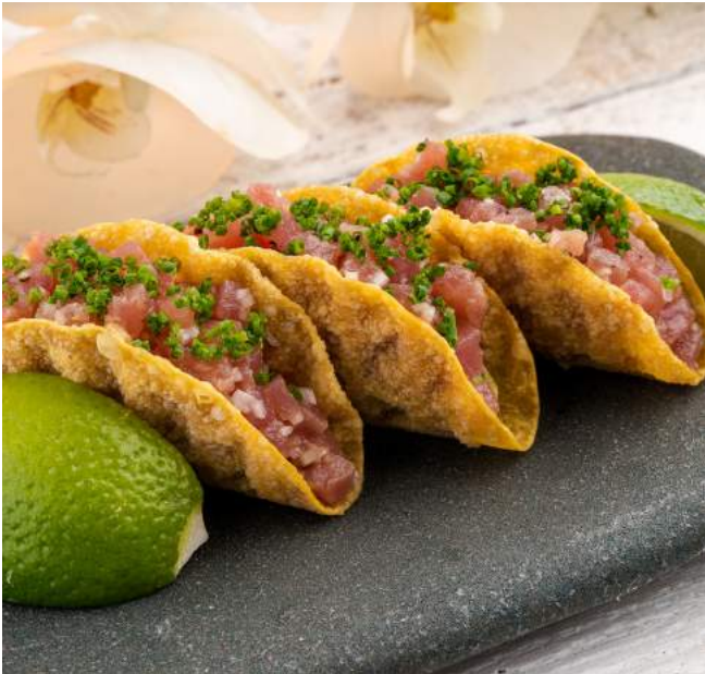
TUNA TACOS Yuzu dressing, Chives