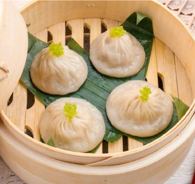
FISH XIAO LONG BAO 34