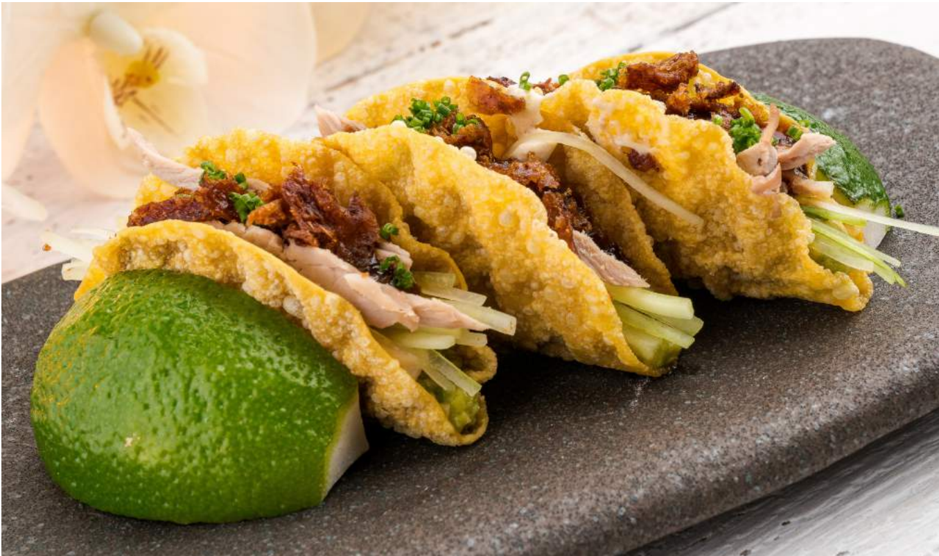
DUCK TACOS Peking Duck, Hoisin sauce