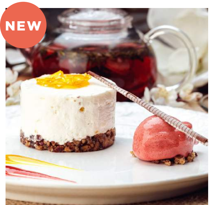
YUZU CHEESE CAKE WITH STRAWBERRY SORBET 48