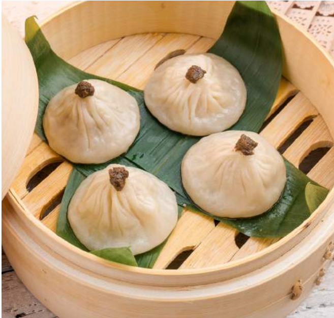
BLACK TRUFFLE & VEAL XIAO LONG BAO 35