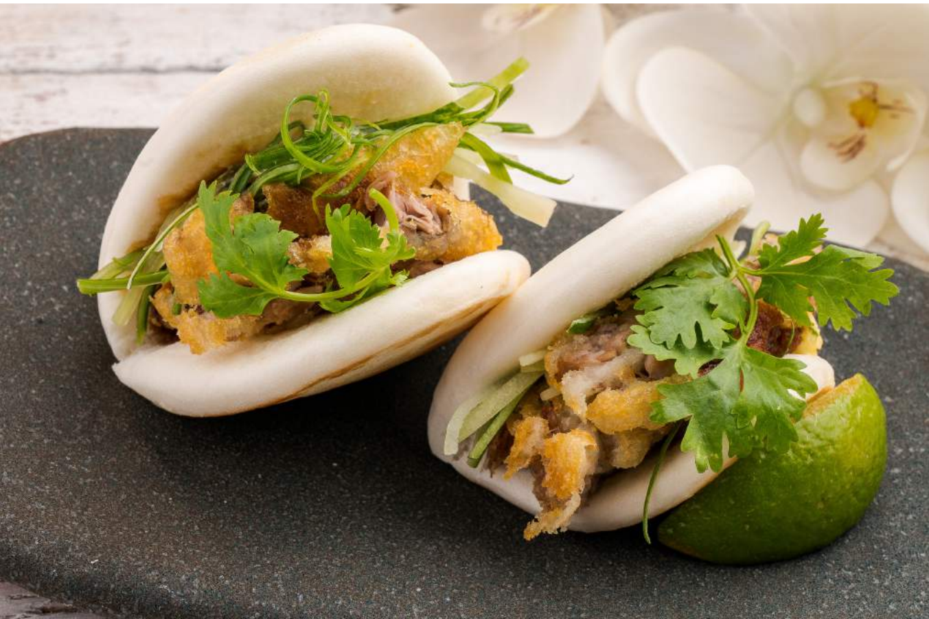
STEAMED PEKING DUCK BUNS