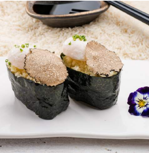
TRUFFLE MAYO 45 QUAIL EGG