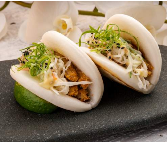
STEAMED CHICKEN KATSU BUNS