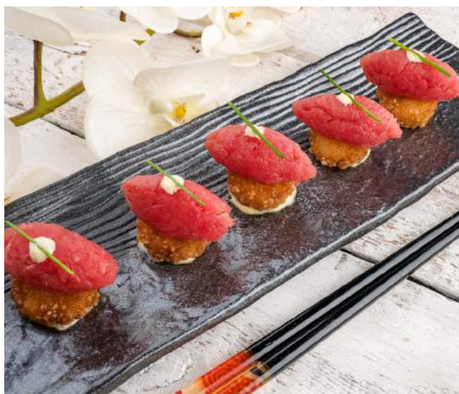
TUNA ON CRISPY RICE