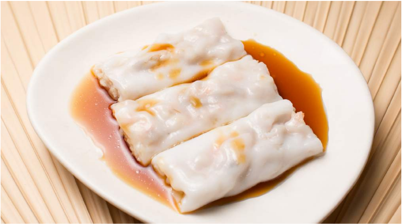
CHICKEN CHEONG FUN SHRIMP CHEONG FUN