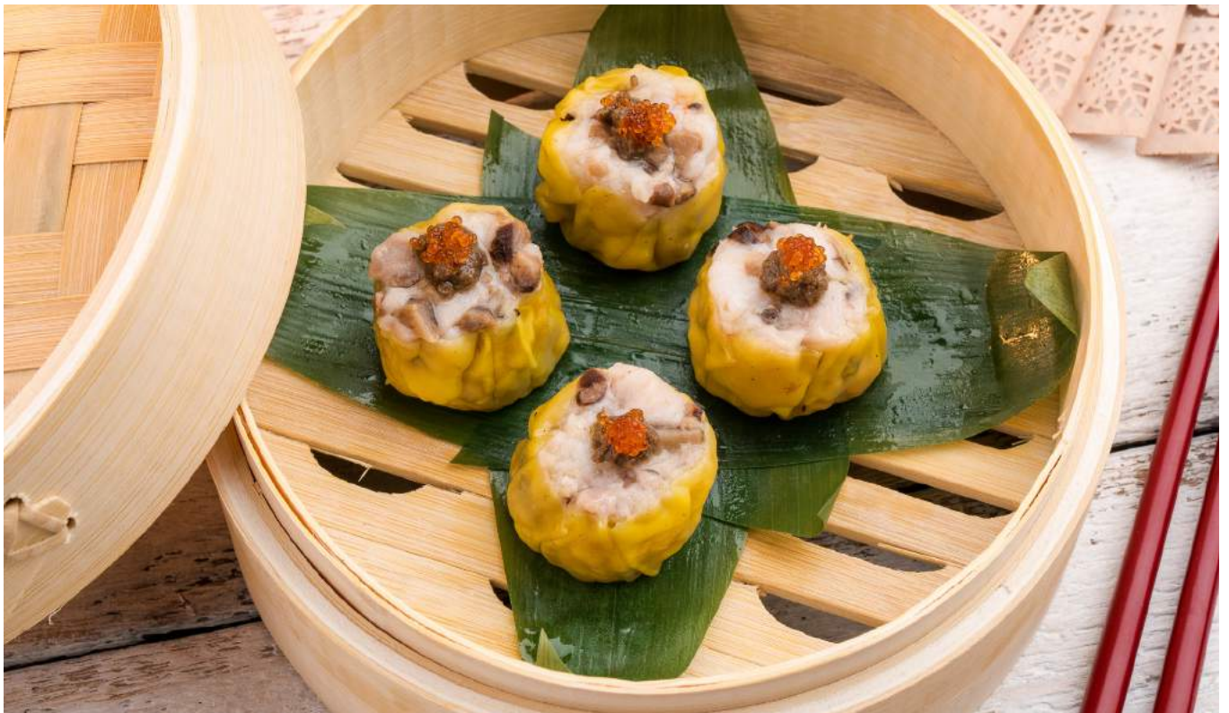
CHICKEN & SHRIMP DUMPLINGS