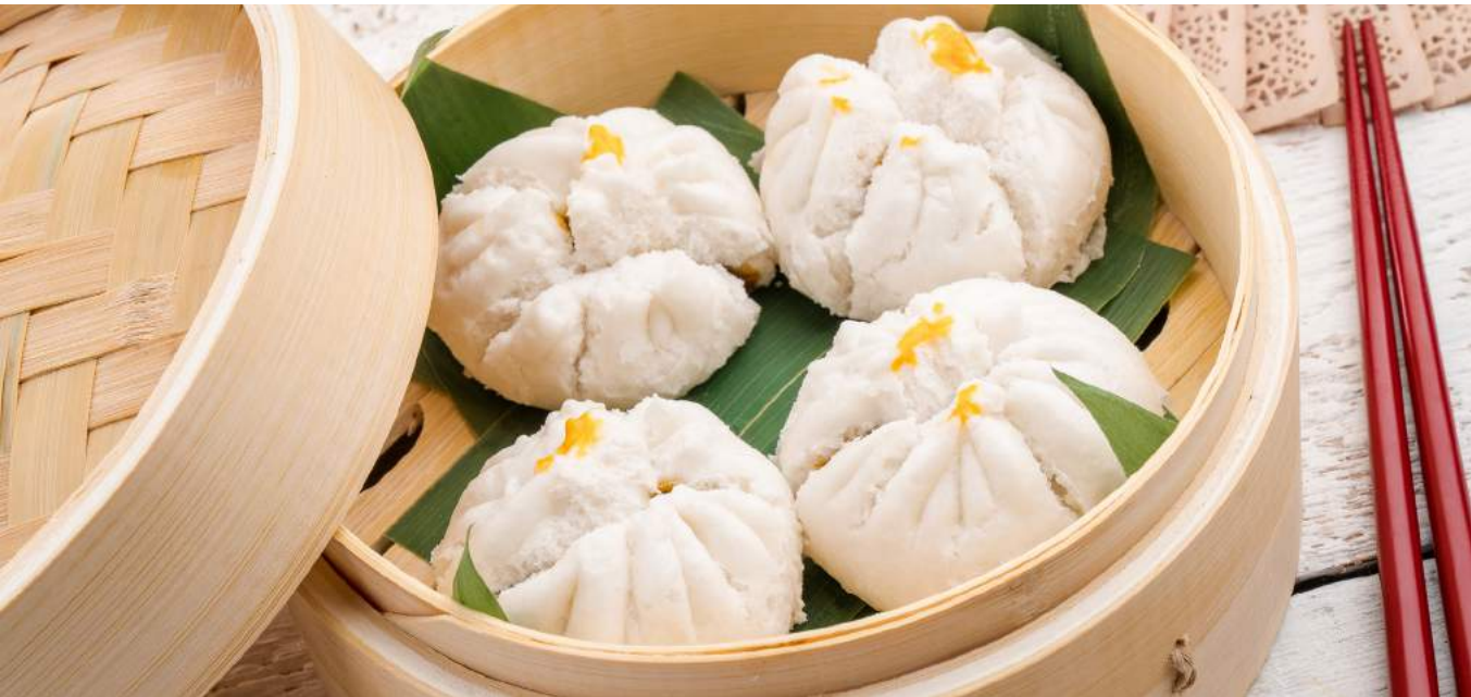
BEEF BUNS 42 20