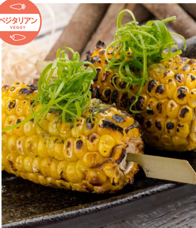
SWEET CORN JAPANESE HERB BUTTER