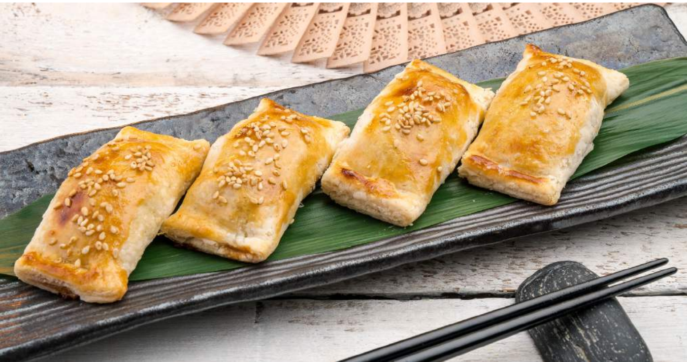
BAKED TRUFFLE VEAL