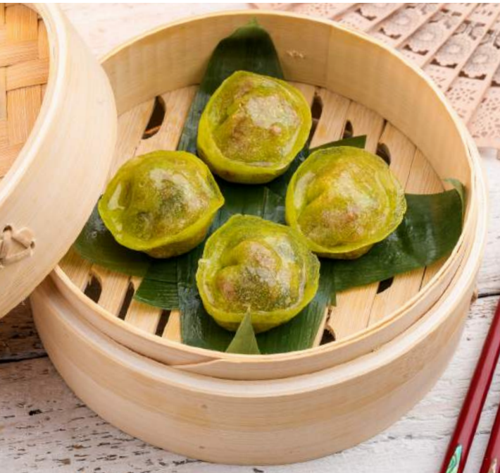
LAMB & EGGPLANT DUMPLINGS 30