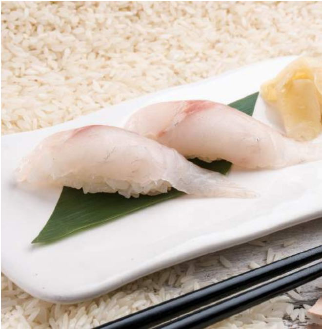
SEA BASS 35