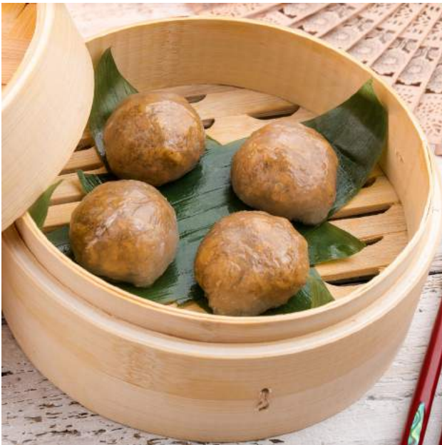
BLACK PEPPER VEAL DUMPLINGS 35