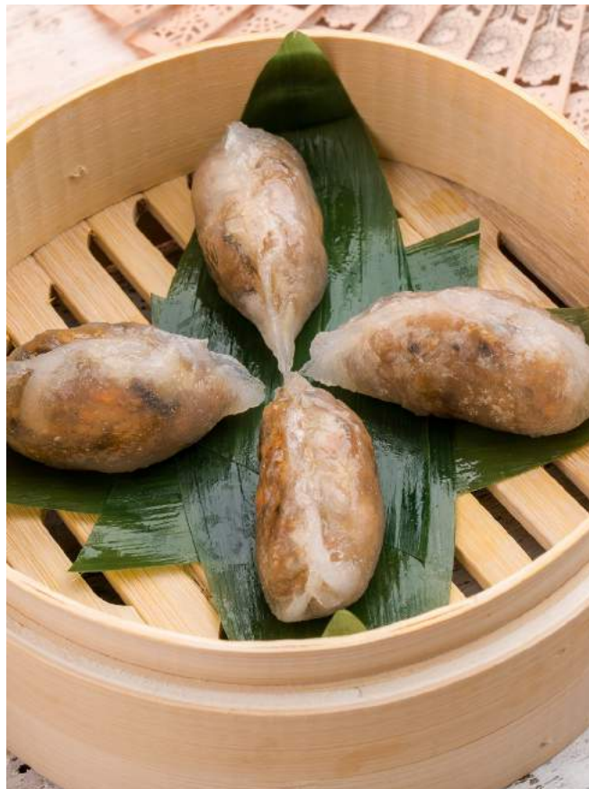
TRUFFLE DUCK & MUSHROOMS DUMPLINGS 32