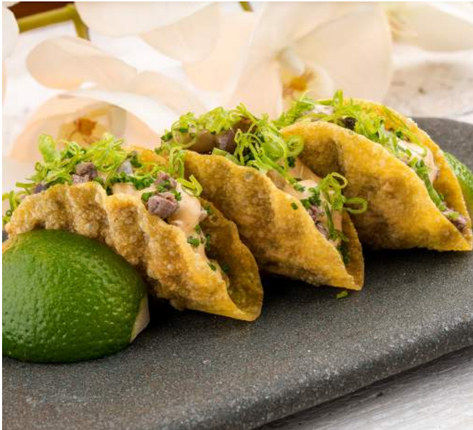
49 BEEF TACOS Chipotle Mayo, Spring Onion