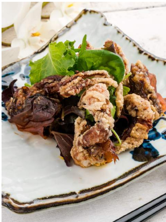
FRIED SOFT SHELL CRAB