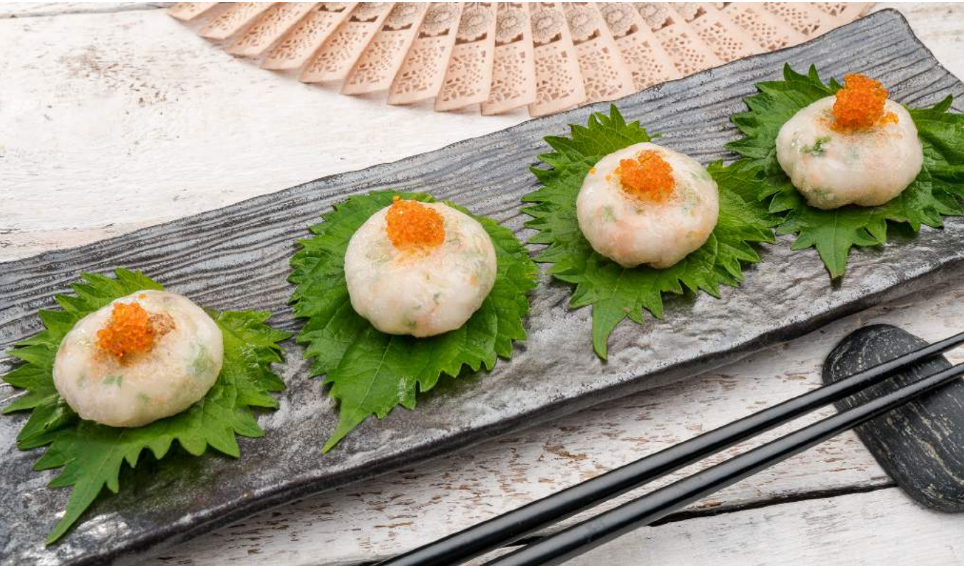
PAN FRIED CORIANDER & SHRIMP