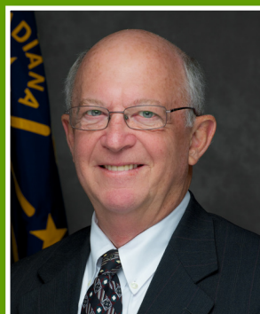
SENATE DISTRICT 46