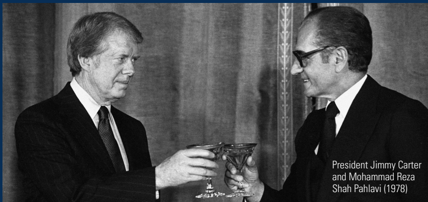
President Jimmy Carter and Mohammad Reza Shah Pahlavi (1978)

In 2013, the CIA formally admitted to orchestrating the 1953 coup known internally as Operation Ajax and engineered by Kermit Roosevelt, the grandson of Theodore Roosevelt. Rapprochement efforts were made during President Bill Clinton and Barack Obama's years. However, Iran continues to be identified as one of the arch enemies of the U.S., and is currently on the list of six nations whose citizens are banned from entering the U.S.