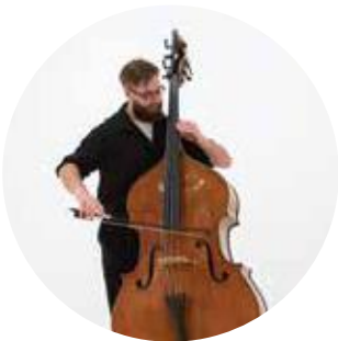
ART OF MUSIC | MAY 5 San Antonio Symphony in the galleries