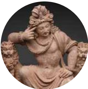
OPENING PARTY: HEAVEN AND HELL | JUNE 15 First look for members