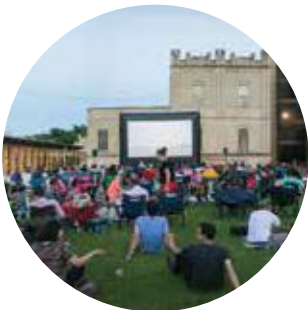
FAMILY FLICKS | MAY 19 & JUNE 23 Film festival favorites