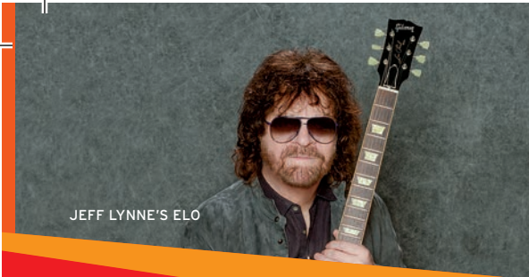
JEFF LYNNE'S ELO