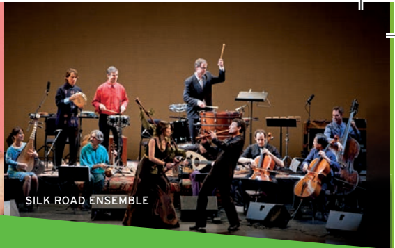
SILK ROAD ENSEMBLE