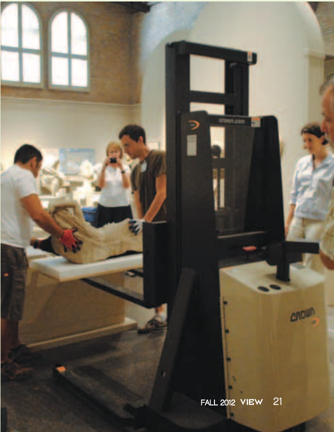
BELOW The exhibition staff uses the new forklift to unpack the Sleeping Ariadne after it returned from loan to the Getty Villa earlier this year.