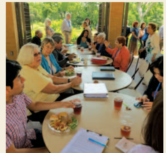
Docent Training Graduates