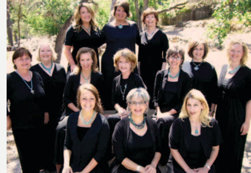
Voci di Sorelle

Live music every Friday on the terrace of the café. Enjoy dinner and wine specials while enjoying views of the River Walk.