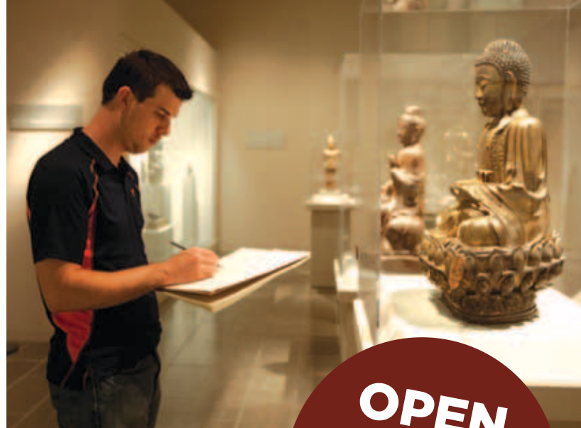
Sketching in SAMA's Asian Art Gallery

Aphrodite was one of the most powerful ancient Greek divinities and has inspired artists for centuries. Follow in their footsteps by sculpting, drawing and painting your own version of Aphrodite. Listen to stories of Aphrodite in the special exhibition gallery, which reveal aspects of this ancient goddess in her various roles as patroness of brides, seafarers and warriors.