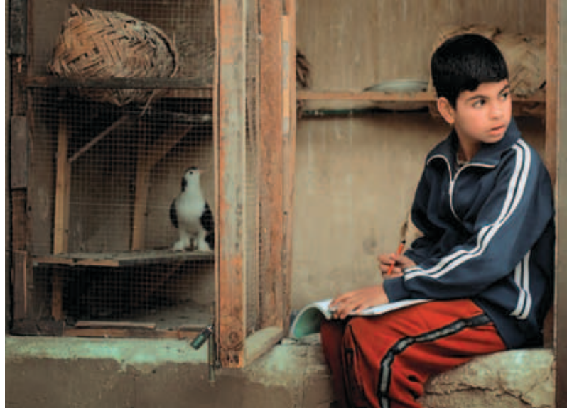
Still from the film Qarantina

The Global Lens film series is sponsored by the Global Film Initiative. Additional support provided by the San Antonio Film Commission.