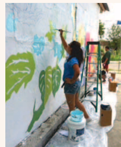
ABOVE Students involved with the program begin work on the mural.