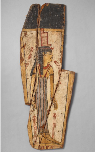
Coffin Panel with Isis

Egyptian, mid-1st century B.C.-early 2nd century A.D.