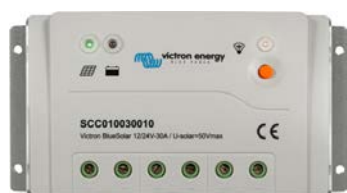
BlueSolar PWM-Pro 10A