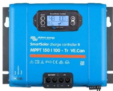
SmartSolar Charge Controller MPPT 150/100-Tr VE.Can with optional pluggable display