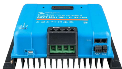
SmartSolar Charge Controller MPPT 150/100-Tr VE.Can without display