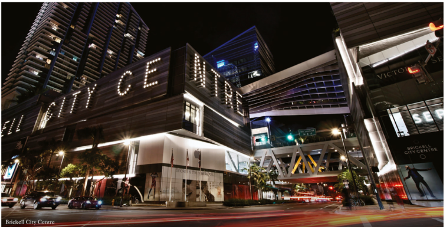
Brickell City Centre

Perfectly positioned at the entrance of Brickell Avenue, where the Miami River meets the beautiful blue waters of Biscayne Bay, and the bustling financial district blends with high-end shopping, top restaurants, cultural hot spots and exiting nightlife – this iconic neighborhood is an all-day all-night lifestyle destination, aptly named the Manhattan of the South.