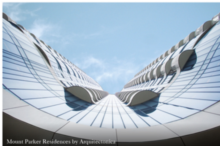
Mount Parker Residences by Arquitectonica