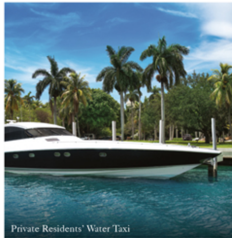
Private Residents' Water Taxi