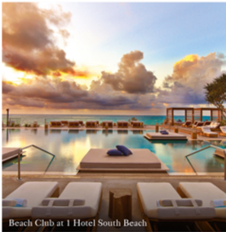
Beach Club at 1 Hotel South Beach

The private marina, planned riverside restaurant and lushly landscaped river promenade invite residents to spend hours and days luxuriating in the infinite energy and organic sparkle of life by the water. Watch the superyachts come and go, take a sunset stroll towards the bay, or head to a number of chic waterside restaurants courtesy of our private water taxi service. Residents can enjoy private membership and exclusive access to the Beach Club at 1 Hotel South Beach, SH Hotels & Resorts sister property. With loungers, beach towel services, cabanas, and seaside snack and beverage services, this waterfront community will cater to leisurely hours under the sun. Take a break from the hustle and bustle of the city and unwind with a cool drink in hand and the sand between your toes.