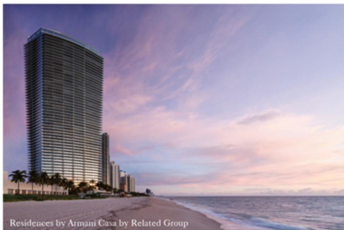
Residences by Armani Casa by Related Group

Renowned Swiss landscape architect Enzo Enea of Zurich-based Enea Garden, is one of the leading landscape architects in the world. A hallmark of Enzo Enea's work is the fusion of indoor and outdoor spaces, the creative intertwining of the soul of the residence with its surroundings.