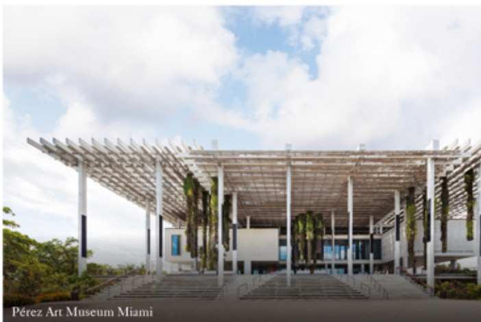
Pérez Art Museum Miami