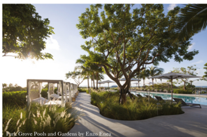
Park Grove Pools and Gardens by Enzo Enea