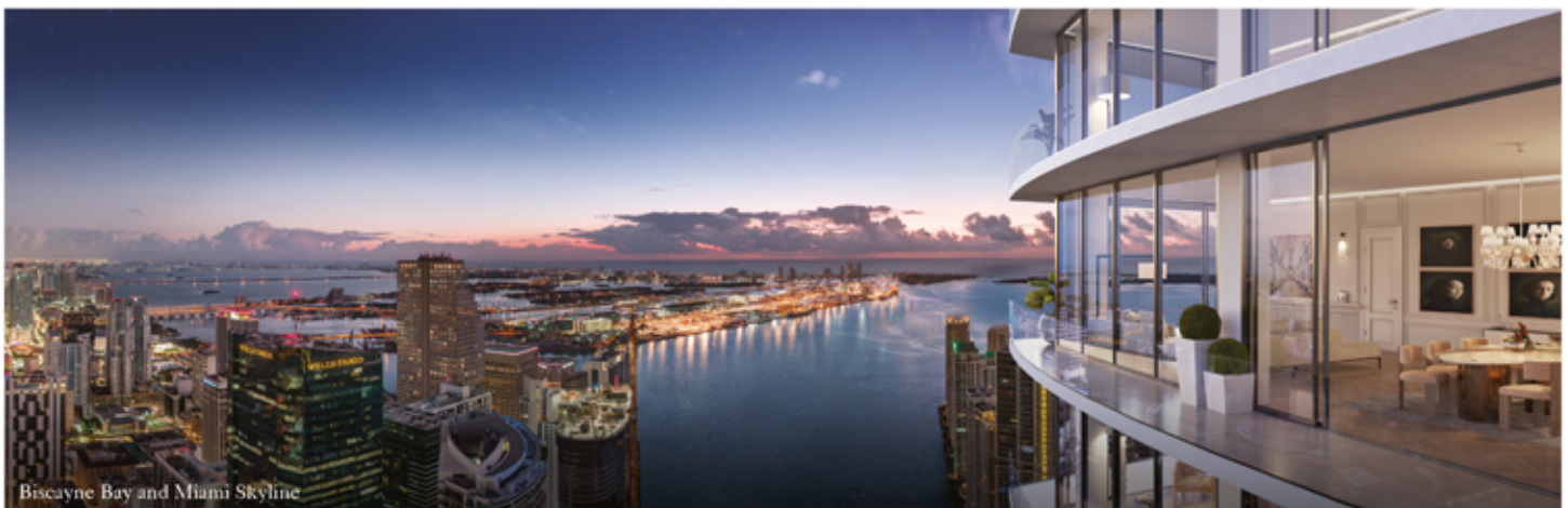
Biscayne Bay and Miami Skyline