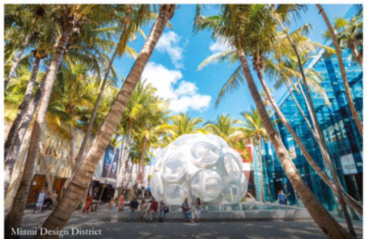
Miami Design District