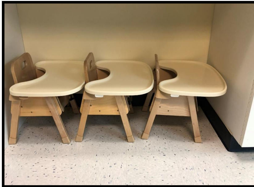
Kitchenette & Feeding Area