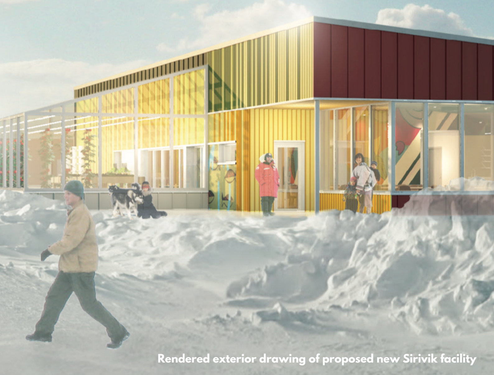
Rendered exterior drawing of proposed new Sirivik facility

In collaboration with Makivik's Pirursiivik Greenhouse and Social Arts Project Sirivik is working towards the development of a new food centre for Inukjuak. The new facility would have an open concept kitchen and dining room that could comfortably host 50 people. An additional multipurpose room will allow for small group activities. The facility will be linked to the current hydroponic greenhouse, while also developing a new year round soil based greenhouse for community members to grow their own food.