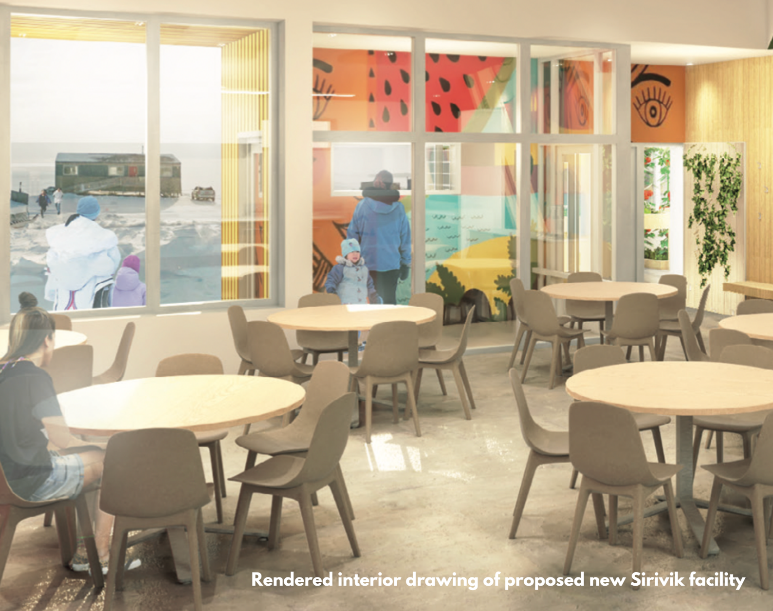
Rendered interior drawing of proposed new Sirivik facility