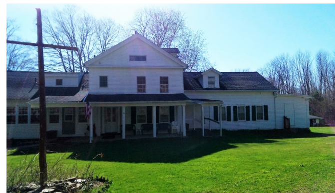
The main house at Trinita Retreat Center