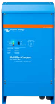
MultiPlus Compact 12/2000/80