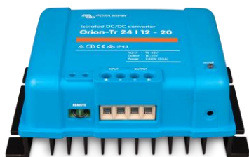
Orion-Tr 24/12-20 (240W)