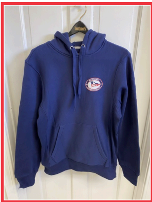
NCS Sweatshirt - Hooded - Navy

Stay tuned for more information and please email francine@nantucketsailing.org if you'd like to get involved.