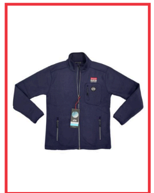
Gill NRW Men's Knit Full Zip Fleece - Navy

Nantucket Community Sailing and Nantucket Race Week gear is available year-round via our website and office. Get your gear: hats, shirts, jackets, rash guards, bags, sailing gear and so much more! Click here to view the full line of products or stop by the NCS Main Office, Monday to Friday, 10am to 4pm.