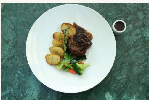
Angus Beef Tenderloin Filet (G.D) Baked Angus beef filet with roasted herbs potatoes & sautéed mix vegetables (678Cal) (Signature dish)