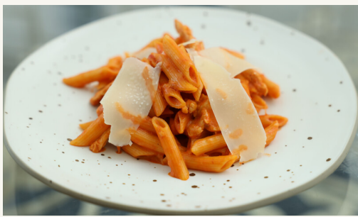
Chicken Penne pasta (D.E.G) Chicken with pink sauce & parmesan cheese (415Cal)