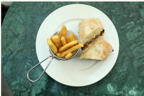
Philly Cheesesteak (D.E.G) Wagyu Beef with caramelized onions topped with mozzarella cheese in ciabatta bread (678Cal) (Signature dish)