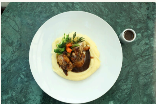
Honey Mustard Chicken (D.M) Chicken breast with honey mustard sauce, mashed potatoes & sautéed vegetables (310Cal) (Best seller)