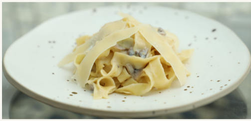
Creamy Fettuccine mushroom (D.E.G) Homemade Fettuccine with porcini mushrooms & parmesan cheese (313Cal)