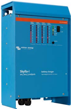
Skylla-i 24/100 (3)