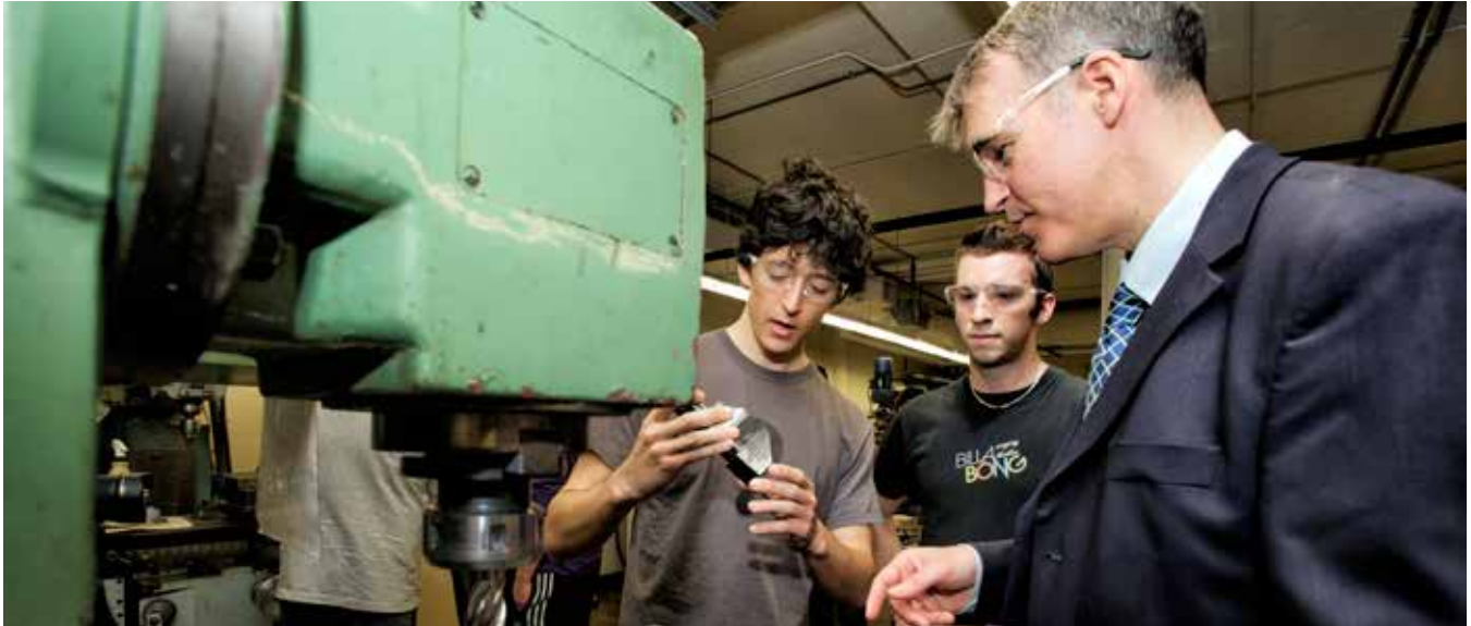
UNIVERSITÉ DE SHERBROOKE