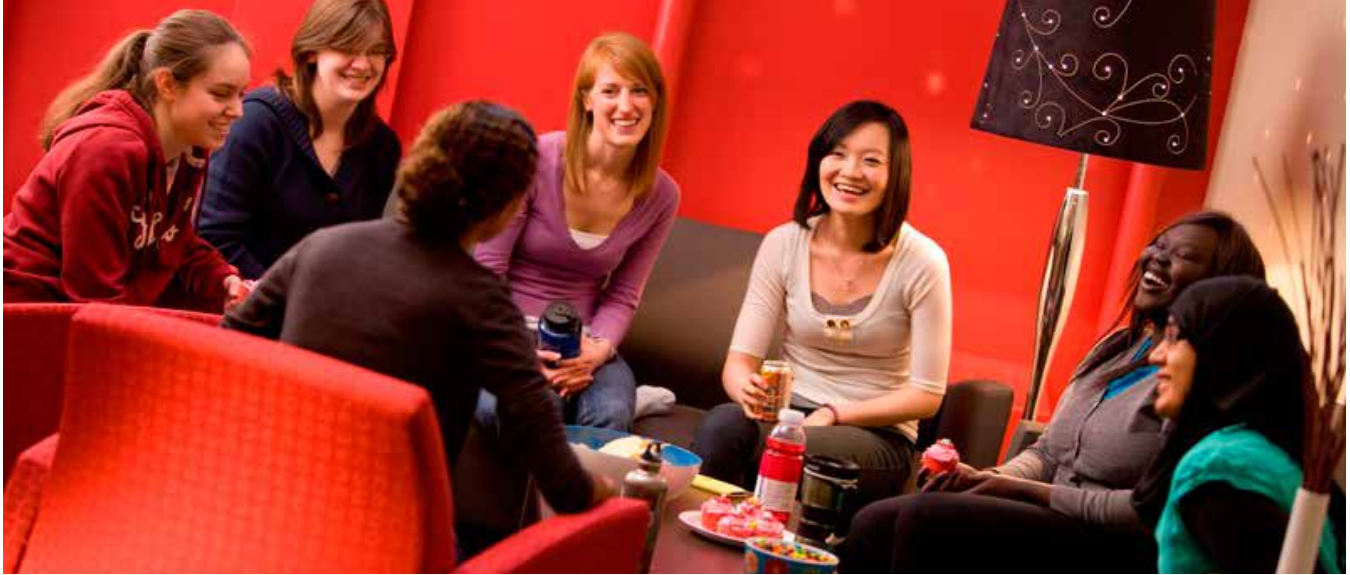
BRESCIA UNIVERSITY COLLEGE

following four years through Brazil's Science Without Borders (SWB) program. Since the program's outset in September 2012, Canadian universities have hosted more than 3,300 SWB students from Brazil. Beyond that, meaningful discussions are setting the stage for even greater collaboration in the years ahead. There are already close to 200 active exchange agreements between Canadian and Brazilian universities. Just think of how much more we can achieve.