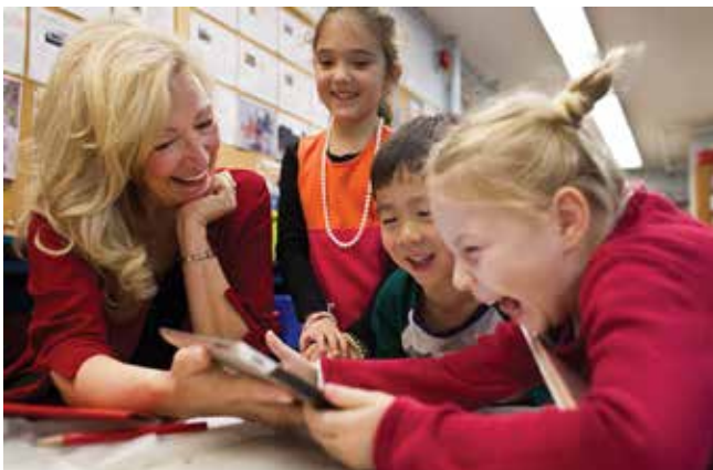
UNIVERSITY OF TORONTO

The City of Thunder Bay, Ontario considers Lakehead University among its economic drivers. “Lakehead University is a catalyst for social, economic and cultural development in Northwestern Ontario and an intellectual force in local, regional, national and global communities.” Halifax Mayor Mike Savage counts the area’s six universities as strategic assets on par with ports and airports: “Universities provide real potential. I want to make sure we take advantage of it.” And the City of Waterloo, Ontario sees the value of providing higher education. “You do not have to leave the City of Waterloo for your education. We are home to high-quality educational institutions that can take you from the first day of school to university graduation and beyond with continuing education.”