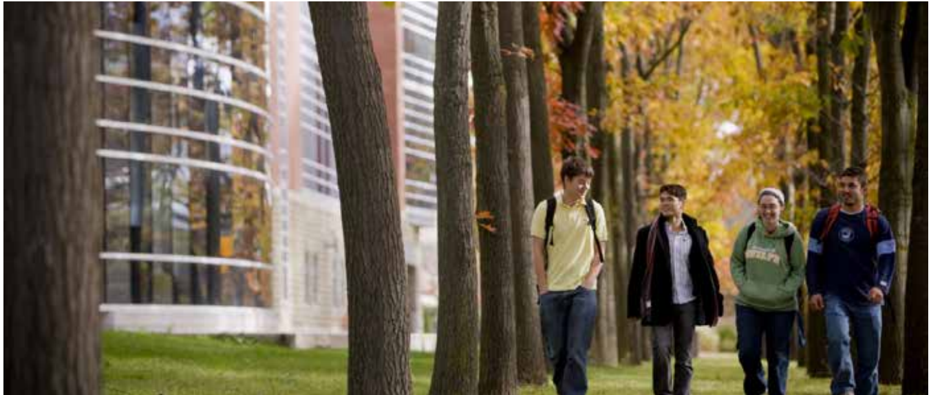
UNIVERSITY OF GUELPH