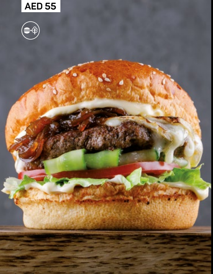
ITALIAN BURGER Beef patty, mozzarella cheese & sundried tomatoes

Beef patty, caramelized onions, brie cheese & homemade truffle sauce