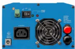
Phoenix Inverter 12/800 with IEC-320 socket