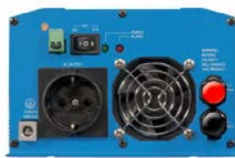
Phoenix Inverter 12/800 with Schuko socket