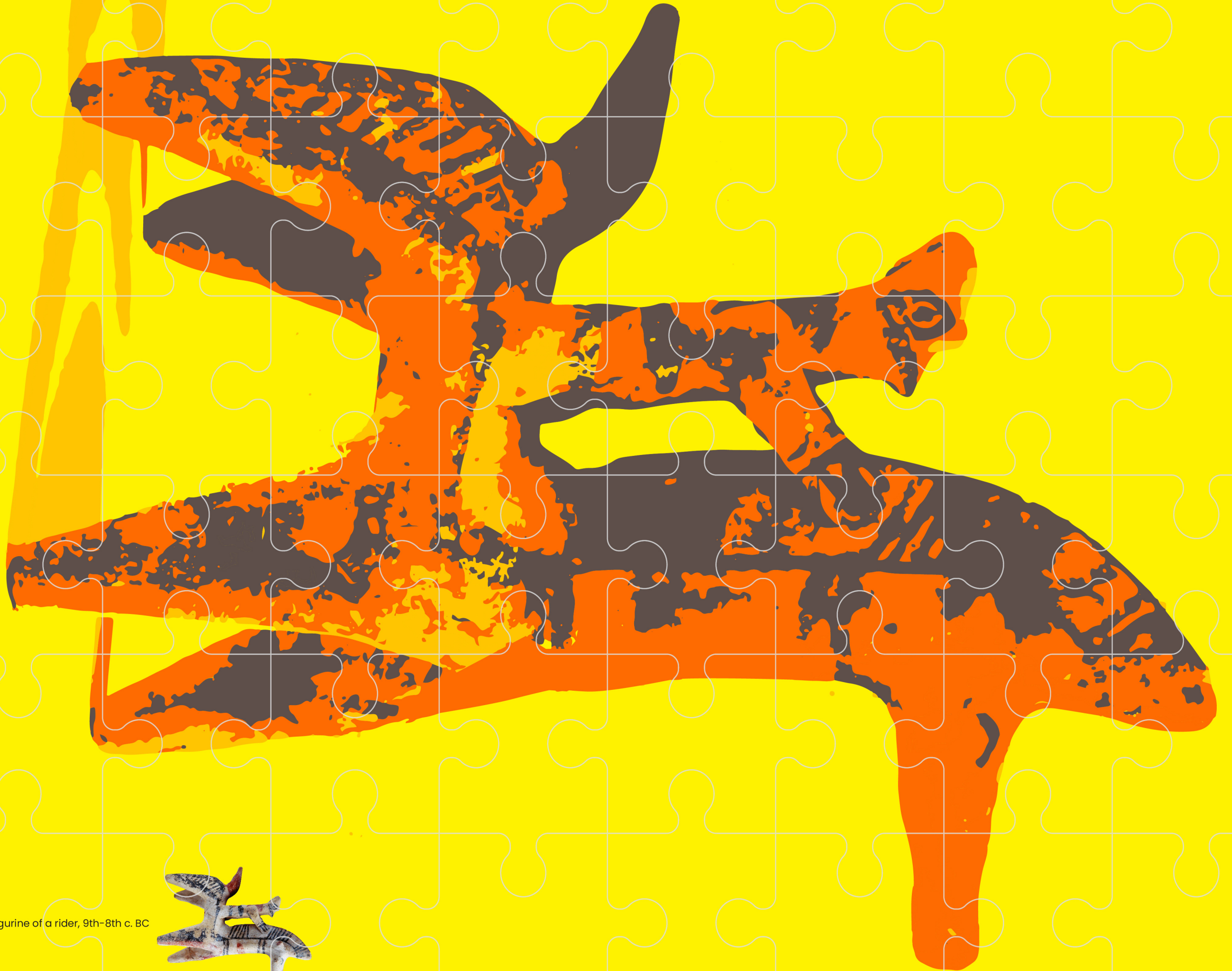
Terracotta figurine of a rider, 9th–8th c. BC