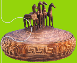
Clay vessel with lid decorated with four horses | 760-750 BC