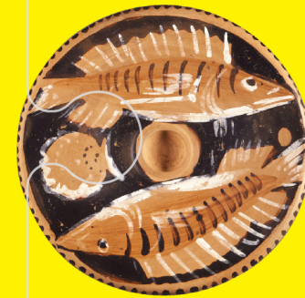
Red figure fish plate | 4th century BC