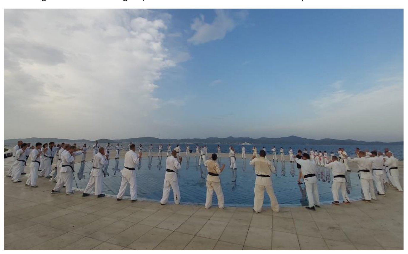
Sea Organ – an architectural sound art object and an experimental musical instrument, which plays music by way of sea waves and tubes located underneath a set of large marble steps

Greeting to the Sun - remarkable installation made out of 300 photo-sensitive glass plates that absorb daylight and transform into a wondrous light show at night. Designed by Nikola Bašić who also designed Zadar Sea Organ (both are 20 min. walk from the Hostel)