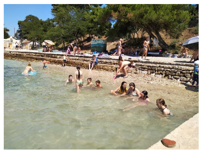
So, there will be plenty of time left to enjoy the sea and the sun and to tour the sights of the city.