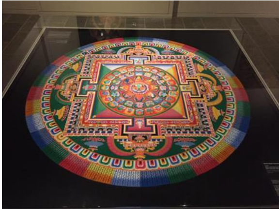
Medicine Buddha Sand Mandala