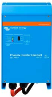
Phoenix Inverter Compact 24/1600

The possibilities of paralleled high power inverters are truly amazing. For ideas, examples and battery capacity calculations please refer to our book 'Energy Unlimited' (available free of charge from Victron Energy and downloadable from www.victronenergy.com ).