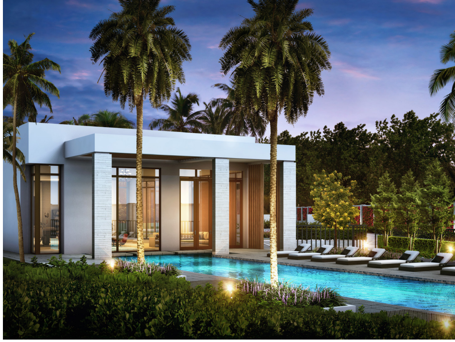
ARTIST'S RENDERING. SEE LEGAL DISCLAIMERS ON PAGE 20