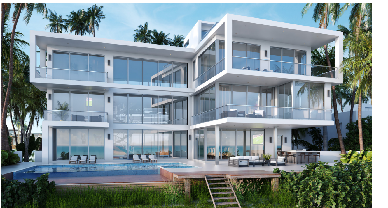
ARTIST'S RENDERING. SEE LEGAL DISCLAIMERS ON PAGE 20