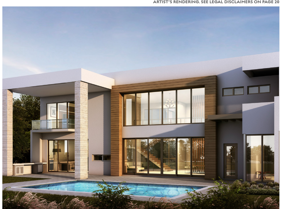
ARTIST'S RENDERING. SEE LEGAL DISCLAIMERS ON PAGE 20