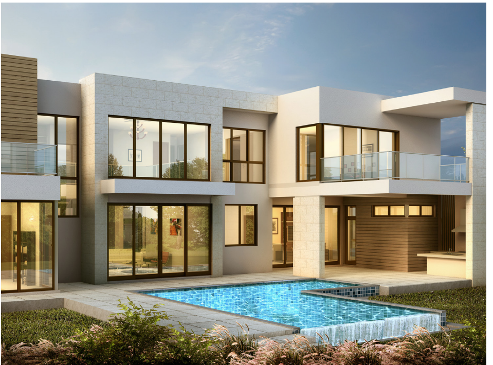
ARTIST'S RENDERING. SEE LEGAL DISCLAIMERS ON PAGE 20