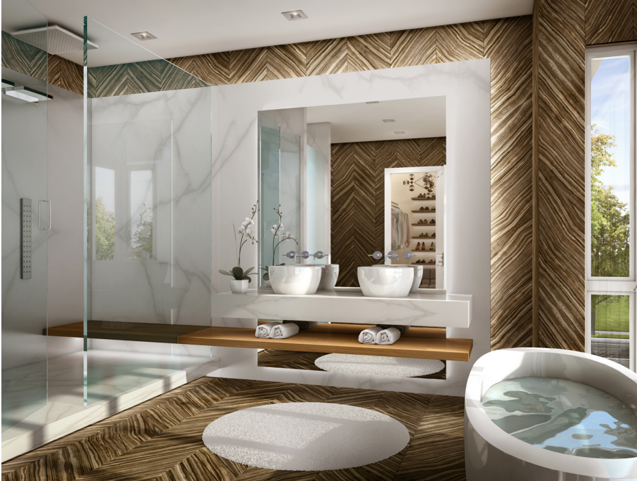
ARTIST'S RENDERING. SEE LEGAL DISCLAIMERS ON PAGE 20