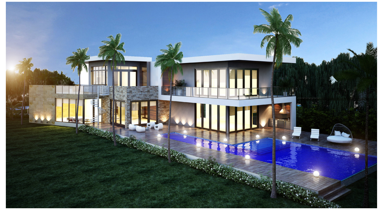
ARTIST'S RENDERING. SEE LEGAL DISCLAIMERS ON PAGE