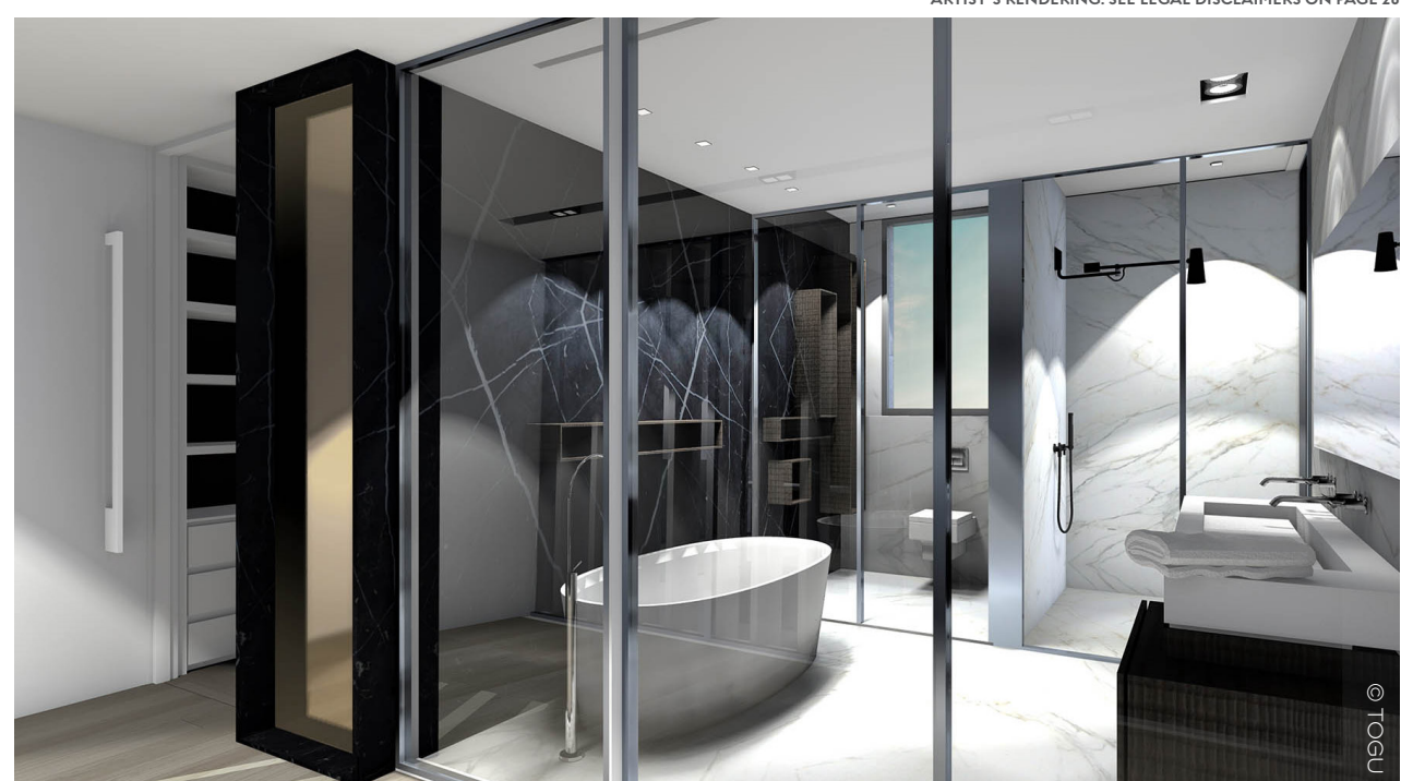
ARTIST'S RENDERING. SEE LEGAL DISCLAIMERS ON PAGE 20