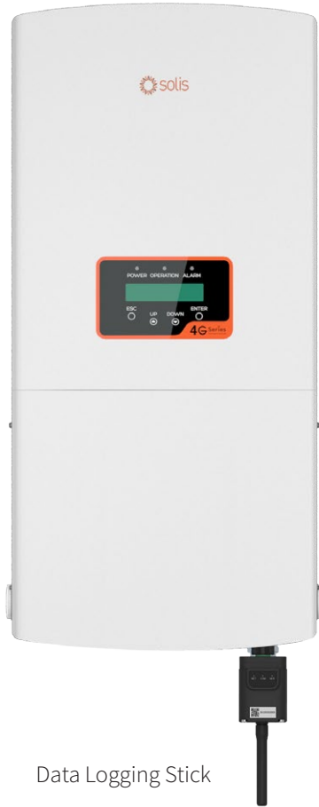
Data Logging Stick