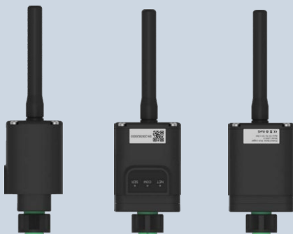
Data Logging Stick 4G