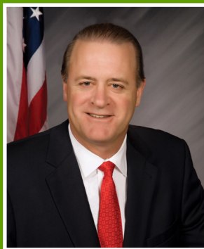
SENATE DISTRICT 16