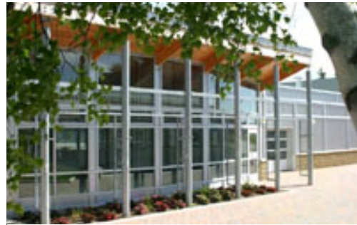
Environmental Technology Wing, Fleming College

As an example of the innovation that is possible in the Ontario college system, Fleming College has received a Leadership Award from the Ministry of Energy for its Environmental Technology Wing which was designed to showcase green technology. The facility, opened in 2004, acts as a living, working classroom featuring an interconnected living laboratory, a green roof, a constructed wetland, and a wind turbine for alternative energy. According to Natural Resources Canada, the Environmental