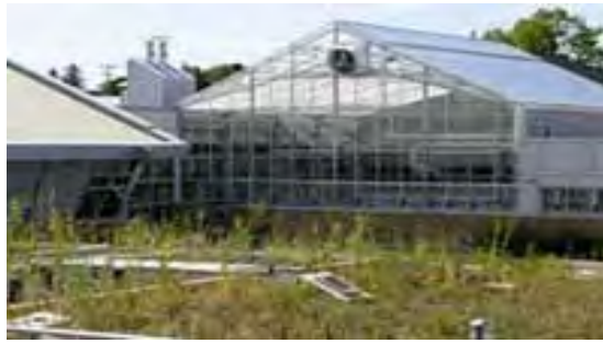
CAWT, Fleming College

Demonstration centres provide opportunities to leverage state-of-the-art equipment and showcase advances in applied research. The Centre for Alternative Wastewater Treatment (CAWT) at Fleming College, for example, promotes constructed wetlands and other innovative forms of wastewater treatment through applied research, education, and demonstration projects.