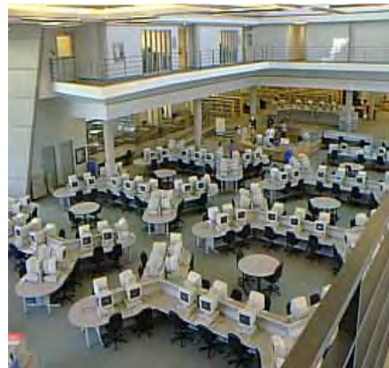
LRC at Seneca@York

Some colleges have created centres for teaching excellence, such as Georgian's Centre for Teaching and Learning, which provides support for teaching staff in instructional design, use of electronic teaching tools, and production of teaching and learning materials.