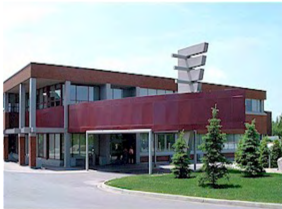
Glenn Crombie Centre, Cambrian College

The Glenn Crombie Centre for disability services at Cambrian College is an example of an education, research, and demonstration centre. The Centre provides the community and business in Northern Ontario with access to resources and consultations on needs and accommodations for people with disabilities. The building is fully accessible with adaptations both inside and outside, and is equipped with state-of-the-art assistive learning technologies. Cambrian students with disabilities use the resources of the centre to achieve their educational goals.