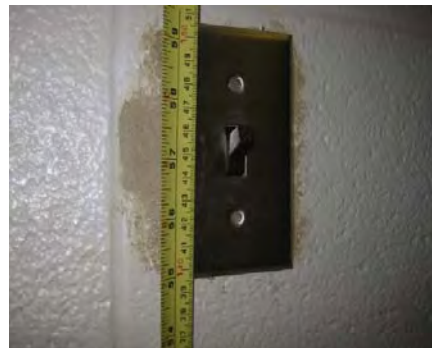
Not ODA Compliant

Industry standards indicate a required annual investment of 1.0% to 1.5% of replacement value to meet adaptation issues. Projects of this nature are numerous and significant in the Ontario college system. Examples at any single college indicate a backlog and pent up need significant enough to warrant a 1.5% investment in the system overall. This translates into an additional annual requirement of $80.8 million per year (OCFMA, 2006).