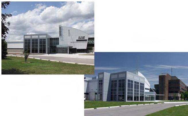
Ford Centre, St. Clair College

The Ford Centre for Excellence in Manufacturing at St. Clair College delivers high quality, hands-on training using sophisticated technology including CNC, plastic injection molding and rapid prototyping machines. Students experience authentic learning experiences that combine theory and practice. They are exposed to current business and industry environments including centralized, just-in-time processes, safe operating practices, work deadlines, precise work skills and habits and develop the ability to follow directions and work in large multi-disciplinary groups.