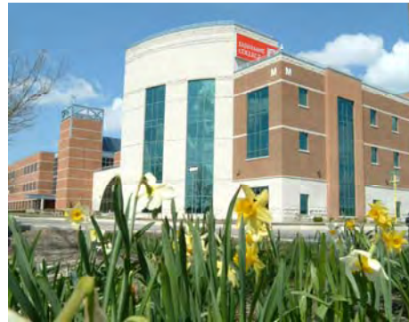
M Building, Fanshawe College