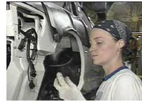
Ford Plant, St. Thomas