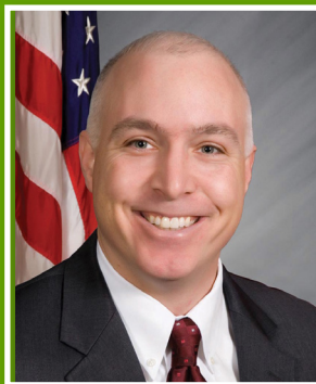
SENATE DISTRICT 29