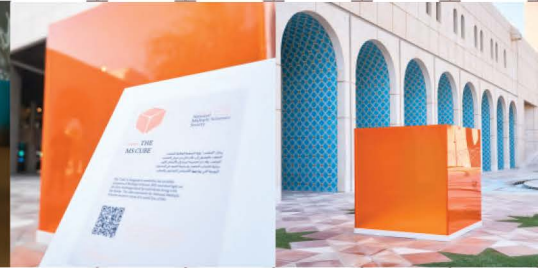
MS Day Cube Activation