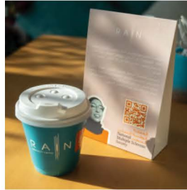
MS Day Cafe Activation

Thank you for the incredible opportunity you have given me to speak up and raise awareness about Multiple Sclerosis. I am positive this society will contribute significantly to the broader understanding of this chronic condition, as well as in the support of so many MS patients!