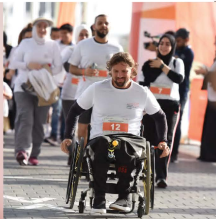
MS Day Walk UAE