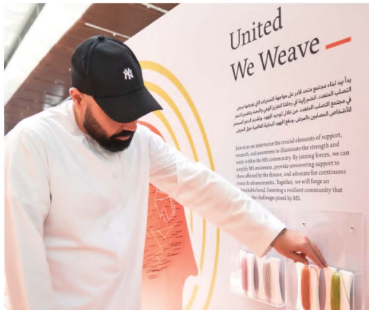
MS Day Kiosk Activation