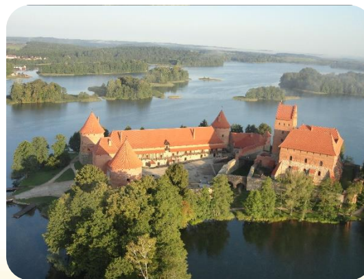
Famous Trakai Castle

Established on 21 st of September 2001 in Trakai