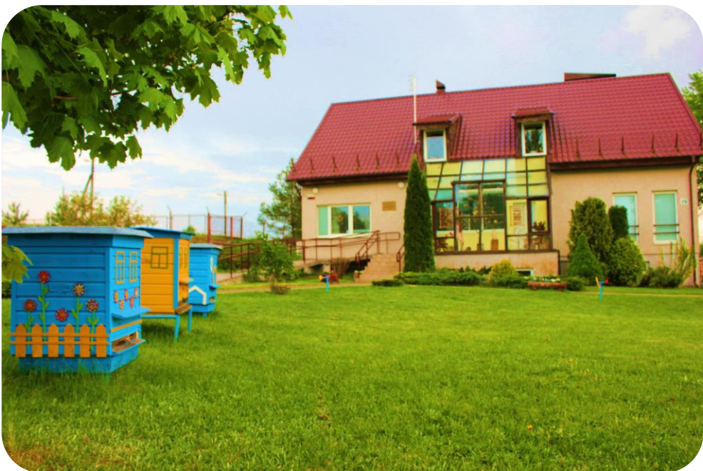
Trakai Employment Center for People with Disabilities