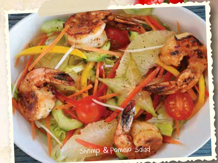
Shrimp & Pomelo Salad