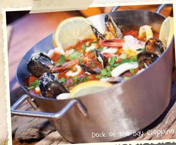
Dock of the Bay Cioppino