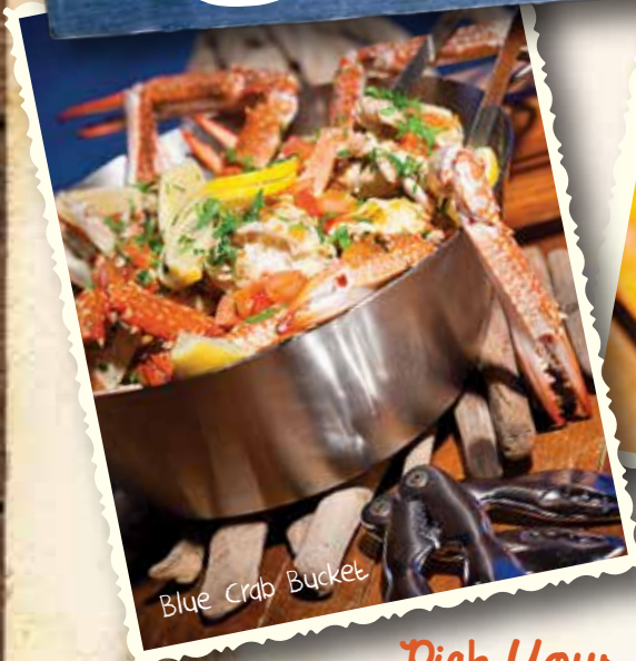
Blue Crab Bucket