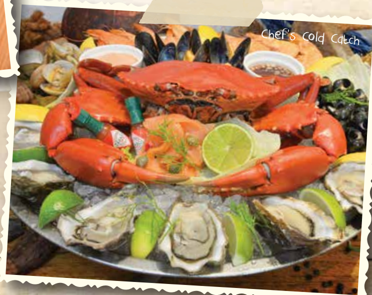
Chef's Cold Catch

Grilled oysters in 4 different appetising styles: tomato-cumin, béchamel, butter parsley, spinach and bread crumbs.