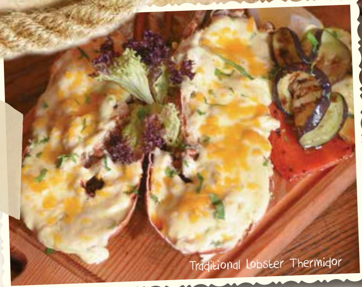
Traditional Lobster Thermidor

Our fish fillet dusted in crispy bread flakes and fried lightly in oil to give you that crunch with attitude. Served with fries and tartar sauce.