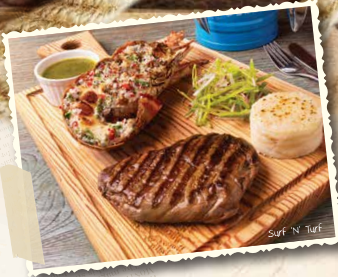
Surf 'N' Turf

A delicious homemade beef patty stuffed with cheese, caramelized onions, pickles and our signature sauce.