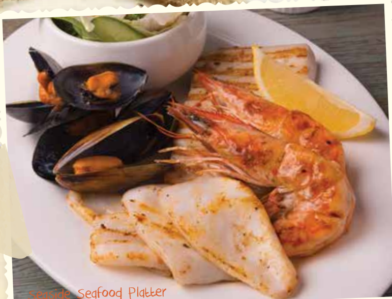
Seaside Seafood Platter

Your choice with our spicy masala curry served with steamed rice for a taste of India.