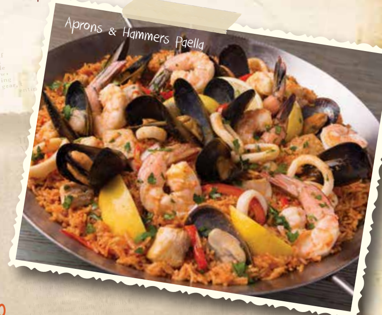
Aprons & Hammers Paella

4 pieces of crabs, 2 pieces of shrimps, 4 pieces corn, mussels, clams, potato and garlic seasoned in old bay spices. Mix bucket perfect for couple.