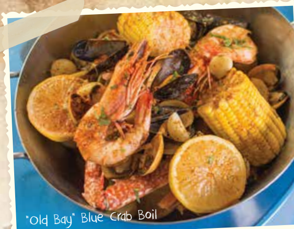
"Old Bay" Blue Crab Boil