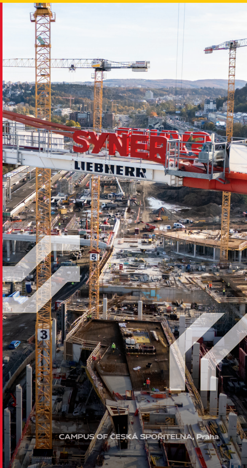
CAMPUS OF ČESKÁ SPOŘITELNA, Praha