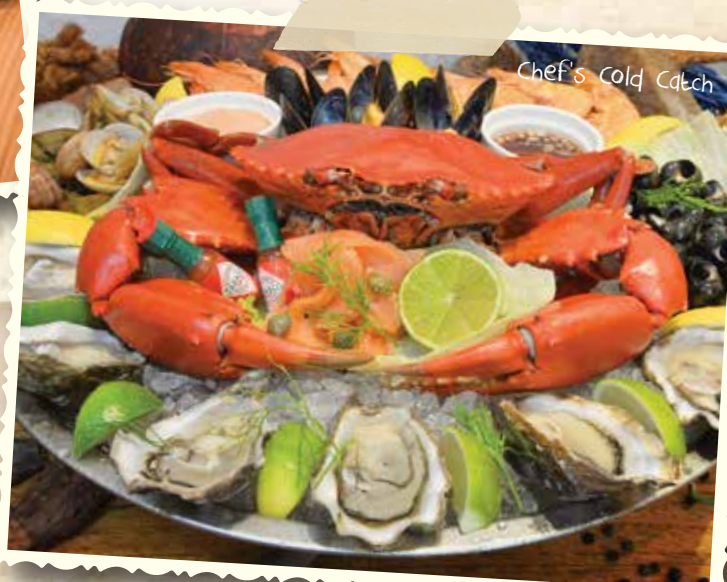
Chef's Cold Catch

Seared Oysters in 4 different appetising styles: tomato-cumin, béchamel, butter parsley, spinach and bread crumbs.