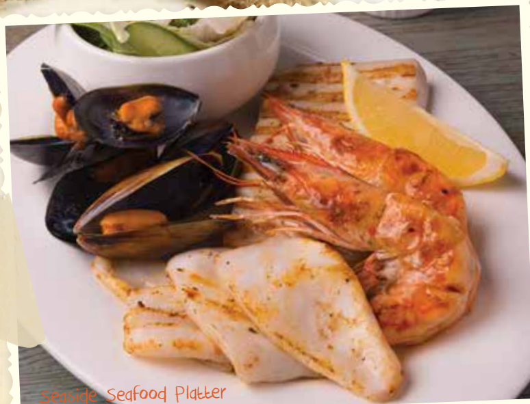
Seaside Seafood Platter

Fresh fish with our spicy masala curry. Served with steamed rice for a taste of India.