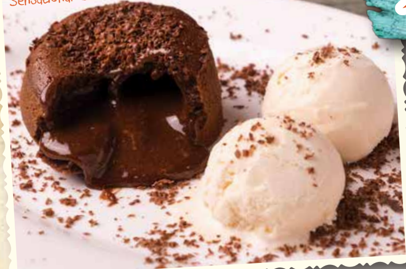
Sensational Chocolate Fondant