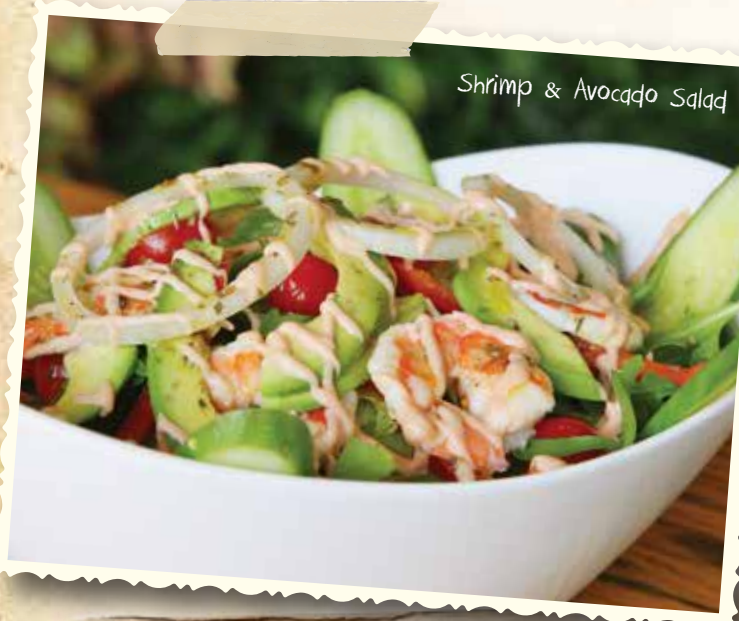
Shrimp & Avocado Salad

Pan seared fresh tuna tossed in with Quail eggs, purple potato, fresh garden greens and Chimichurri and lime vinaigrette dressing.