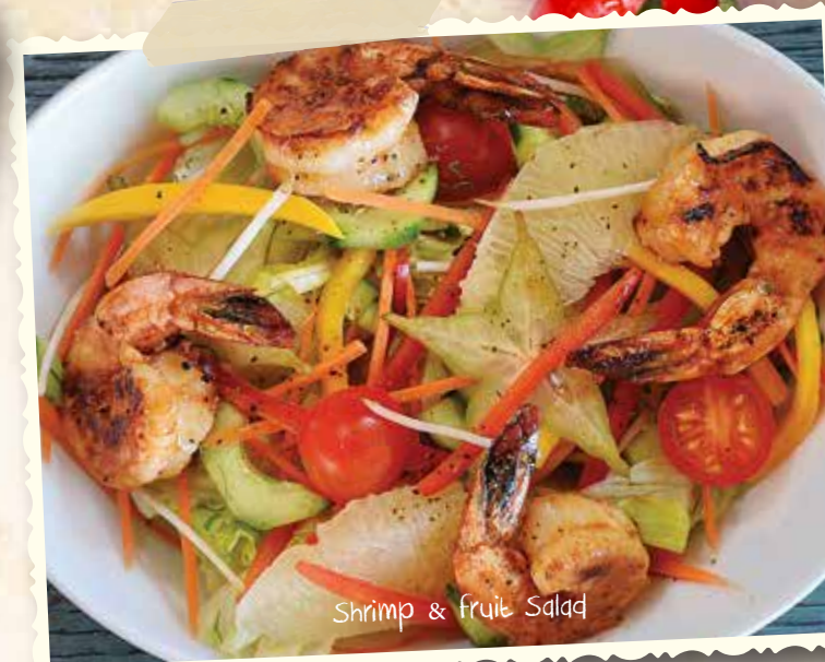
Shrimp & Fruit Salad

Clam meat with our rich New England style creamy broth, served with bread to soak up all the goodness.