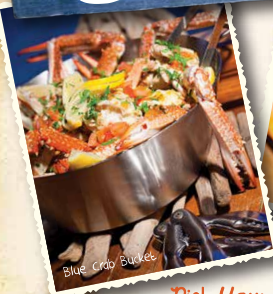
Blue Crab Bucket