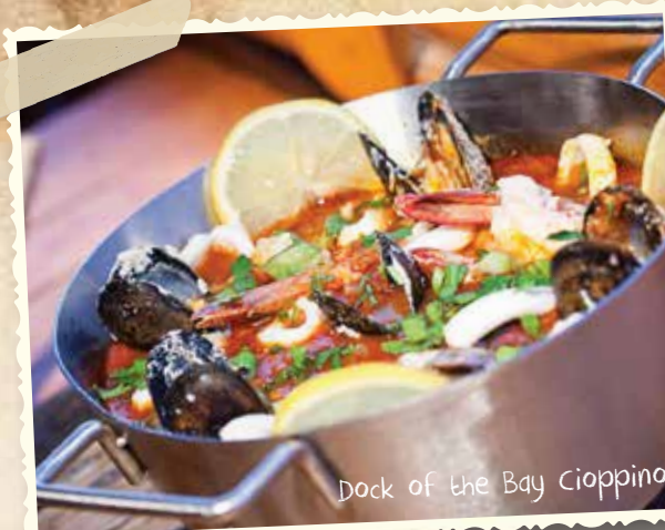
Dock of the Bay Cioppino