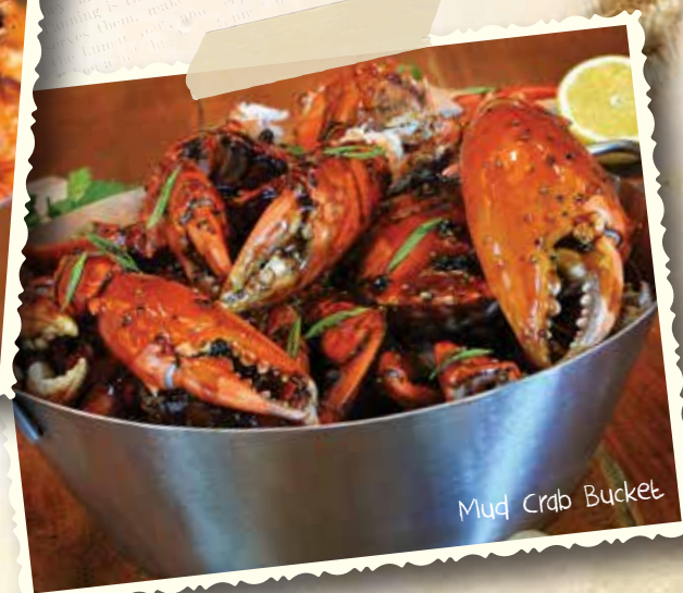
Mud Crab Bucket