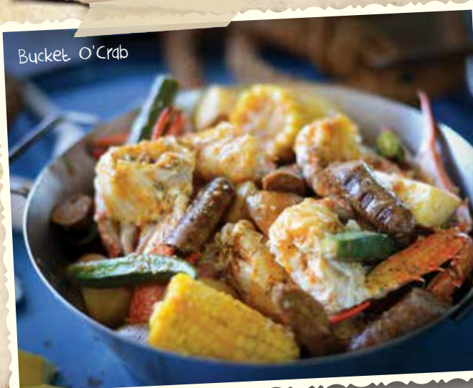
Bucket O' Crab