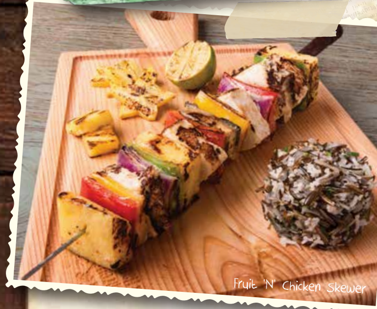
Fruit 'N' Chicken Skewer