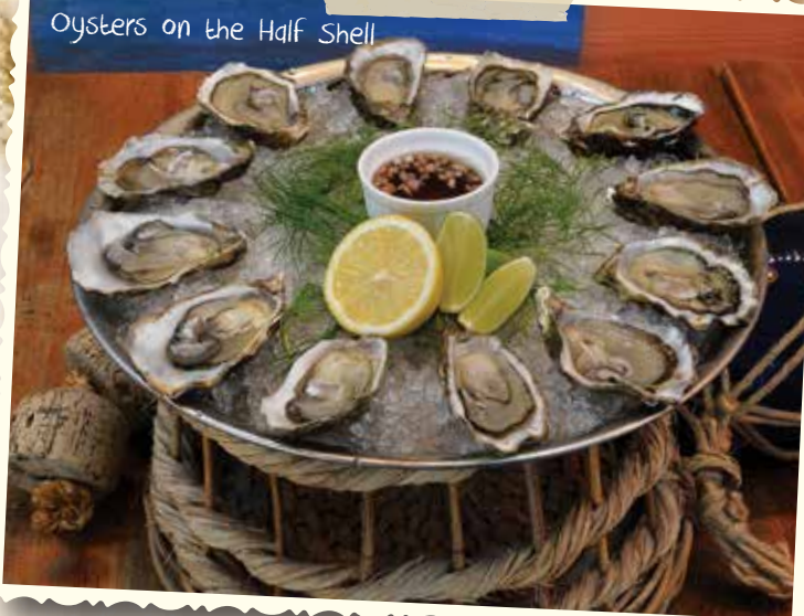
Oysters on the Half Shell

A cold seafood platter with a mud crab, shrimps, oysters, clams, whelks, mussels, and smoked salmon.