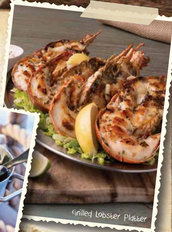
Grilled Lobster Platter