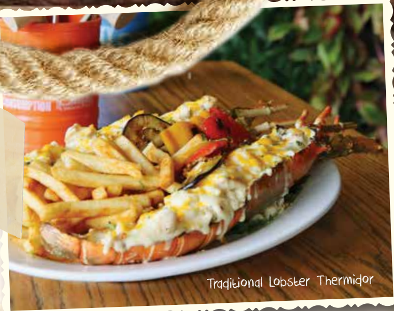
Traditional Lobster Thermidor