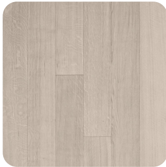
Rift & Quarter (R&Q)