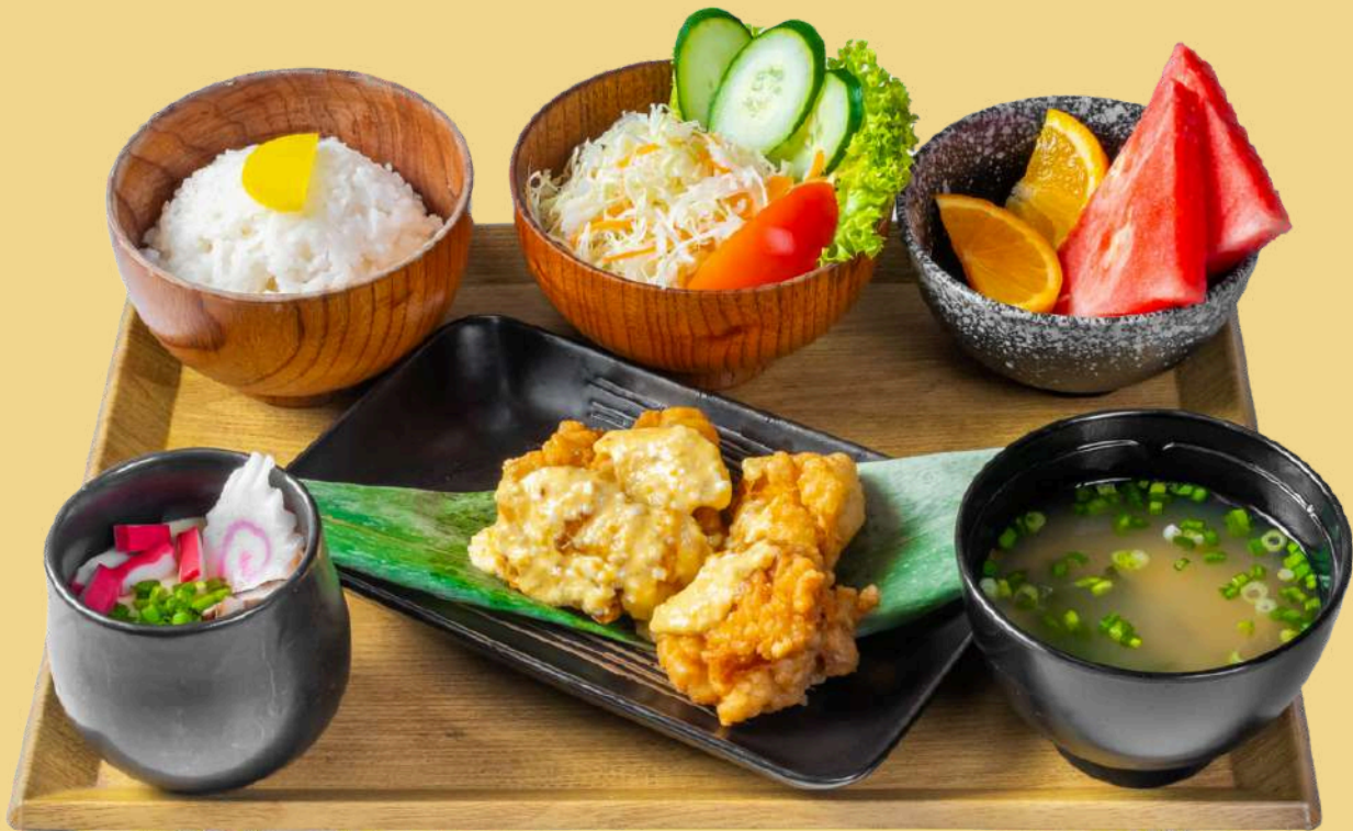
N1. Chicken Nanban Set | 29.80