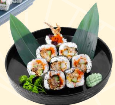
G13. Soft Shell Crab Maki