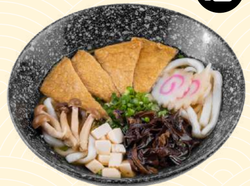
M10. Kake Soba | 19.50 Soba/Green Soba/Udon