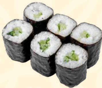
D7. KAPPA HOSOMAKI