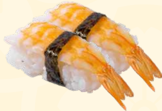
E2. EBI NIGIRI