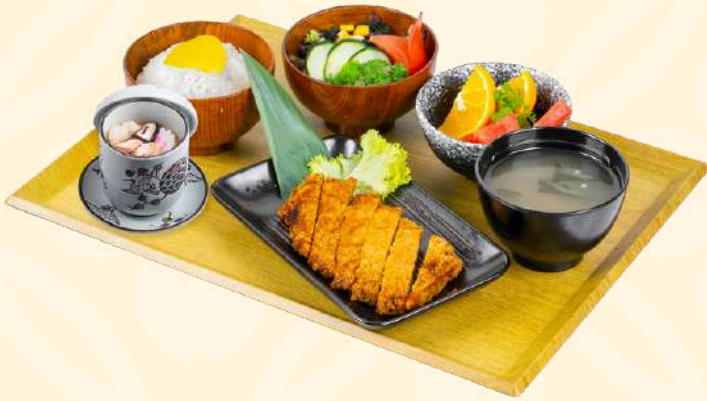
N4. Chicken Katsu Set | 27.2