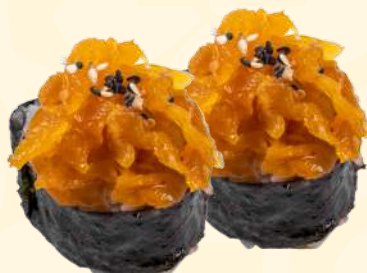
D11. KURAGE MAKI