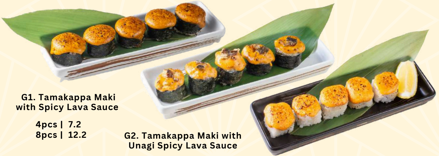
G1. Tamakappa Maki with Spicy Lava Sauce