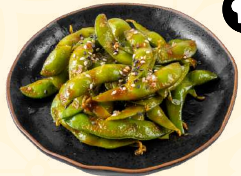
A7. Spicy Edamame | 6.80