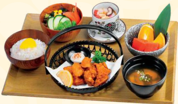
N8. Tori Karaage Set | 29.8