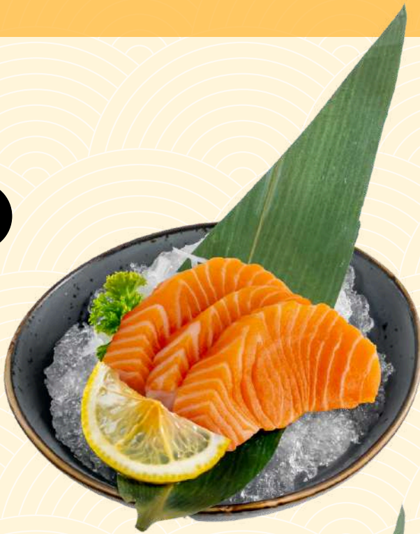
B6. Salmon Sashimi