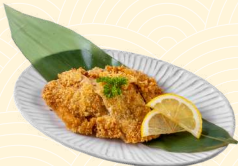
17. Chicken Katsu | 9.8