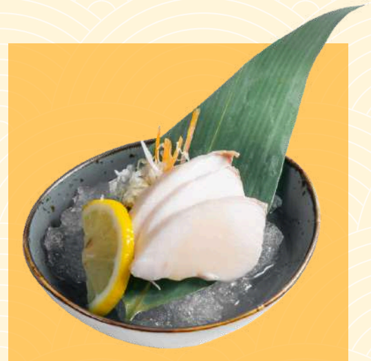
B8. White Tuna Sashimi