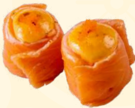
C10. SALMON HANA ABURI MENTAI MAYO 7.8