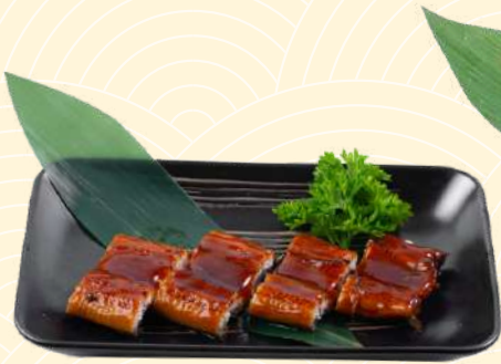
11. Unagi Kabayaki | 18.80