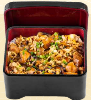
K4. Oyako Jubox | 21.8