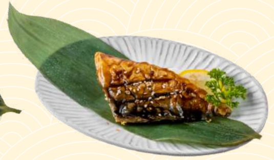
13. Saba | 9.8 (Teriyaki/salt)