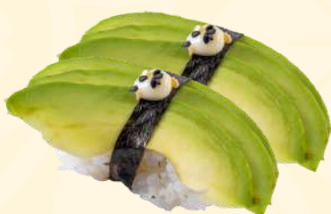
F5. AVO NIGIRI