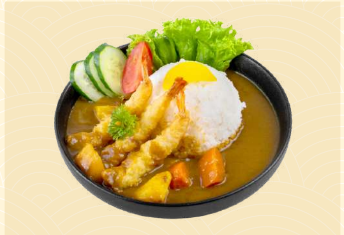
J4. Ebi Tempura Curry Don (4 pcs) | 24