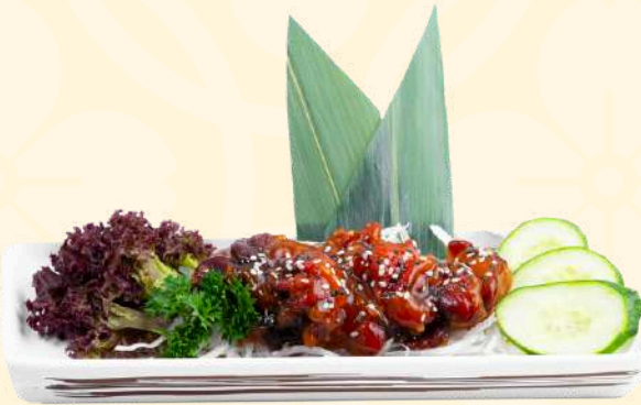
A3. Chuka Idako | 7.20