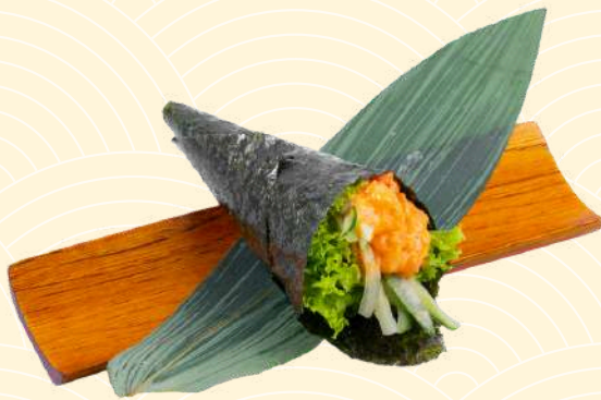
H3. Lobster Salad Handroll | 5.90