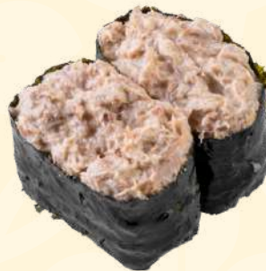
D5. TUNA MAYO GUNKAN