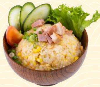
M2. Chicken Chahan | 17.90