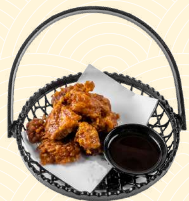
19. Tori Karaage | 13.9