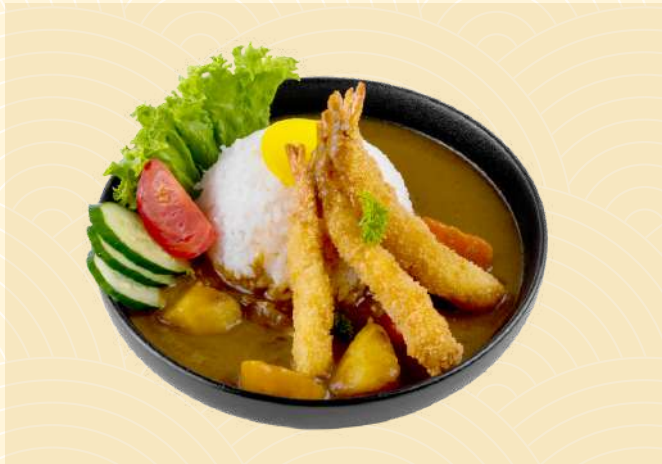
J3. Ebi Fry Curry Don (4 pcs) | 24