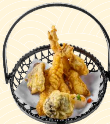
18. Tempura Mori | 12.8