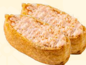
F10. INARI SALMON MAYO