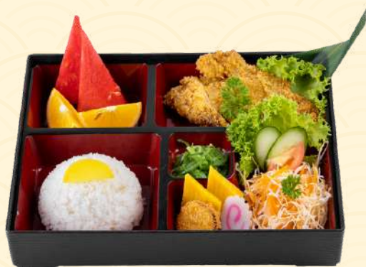
P3. Chicken Katsu Bento | 24.8