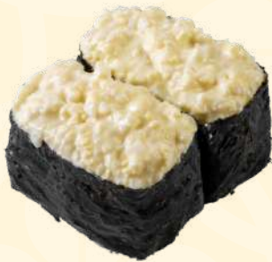
D4. EGG MAYO GUNKAN