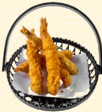
15. Ebi Fry | 16.5