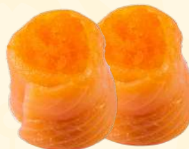
F3. SALMON HANA HANA EBIKO