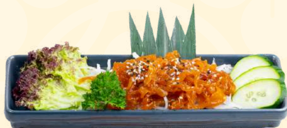
A5. Chuka Kurage | 6.20