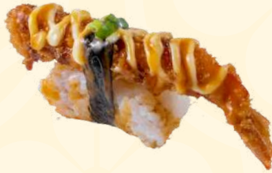
C2. EBI FRY MAYO WITH SPICY SAUCE 4.6