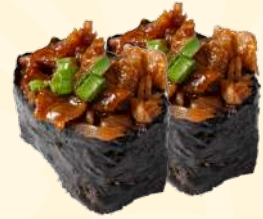
E8. SPICY BEEF TERI GUNKAN