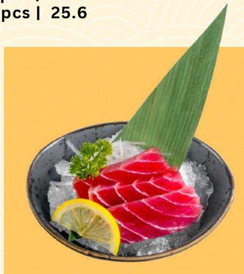
B10. Maguro Sashimi