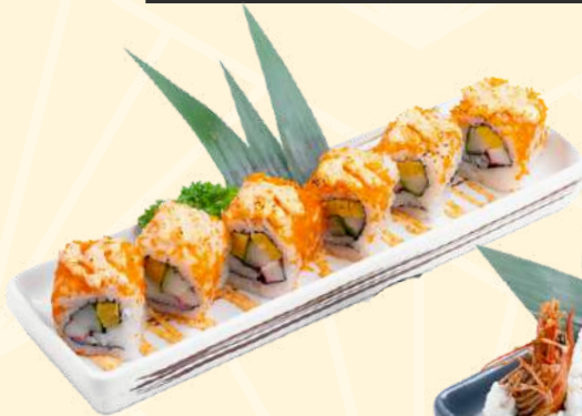
G10. California Maki