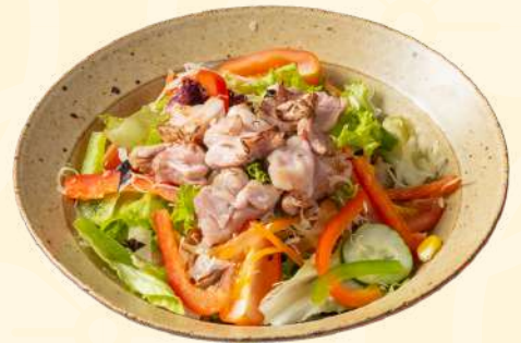
A14. Japanese Salad | 12.90 A15. Salmon Salad | 16.90 A16. Chicken Salad | 14.90