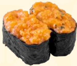
E1. LOBSTAR SALAD GUNKAN