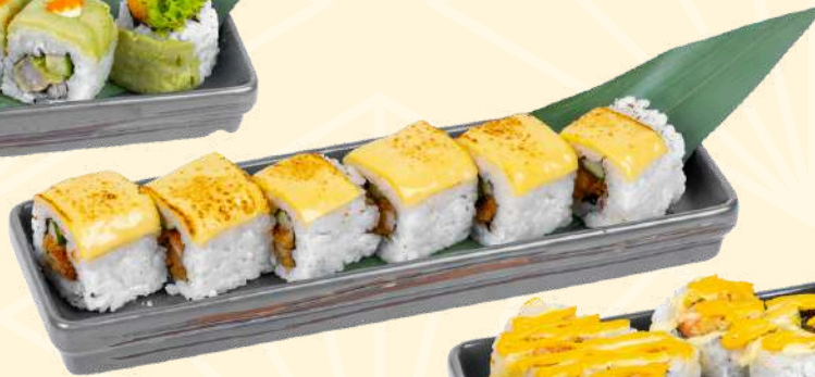
G8. Chicken Katsu Cheese Maki