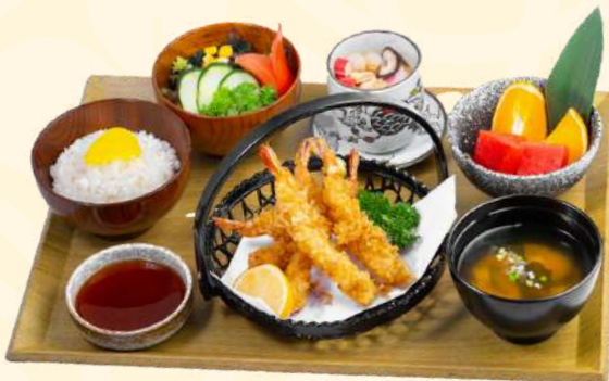
N6. Ebi Tempura Set | 32.8