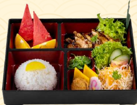
P6. Chicken Teriyaki | 24.8