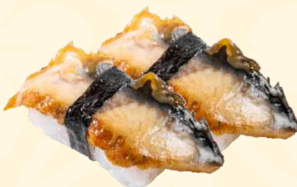
F6. UNAGI NIGIRI