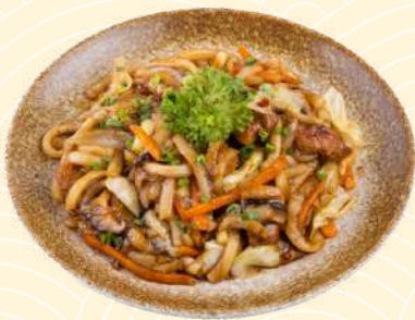
M6. Yaki Udon | 18.90