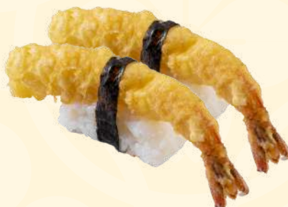
F12. EBI TEMPURA NIGIRI