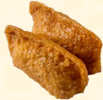
D3. INARI NIGIRI