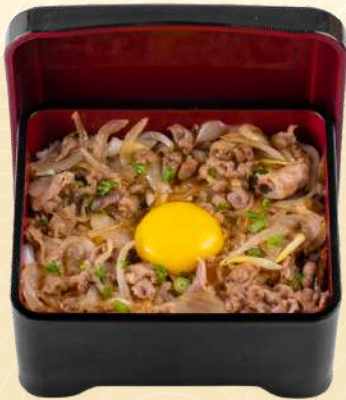
K2. Yakiniku Jubox | 24