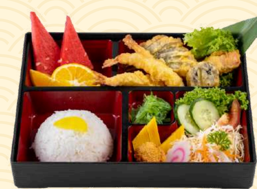
P7. Tempura Mori Bento | 28.8