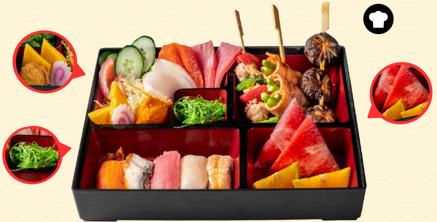
P1. Kazoku Bento | 38.20