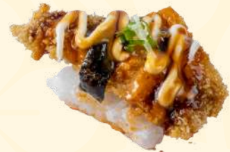
C6. SABA FRY WITH TERIYAKI 3.8