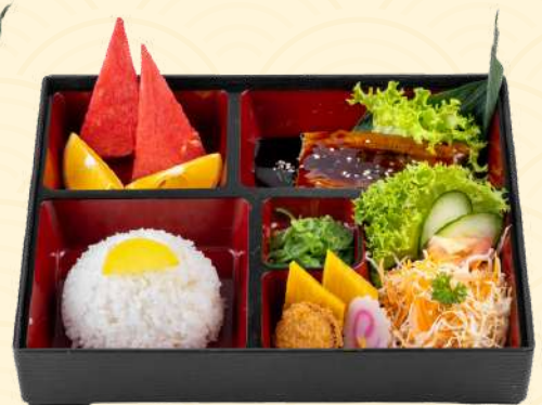
P4. Unagi Bento | 34.8