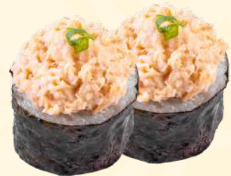
D9. KANI MAYO MAKI