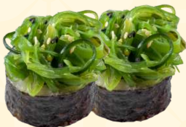
D10. WAKAME MAKI