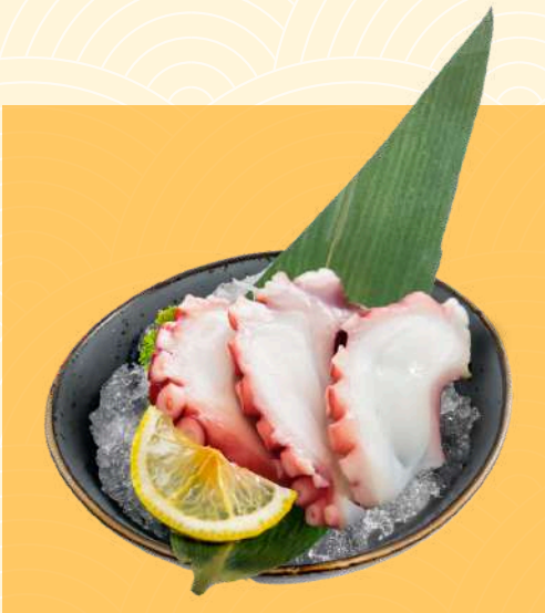
B9. Tako Sashimi