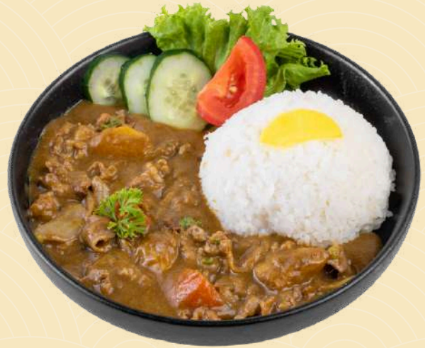
J2. Beef Curry Don | 24