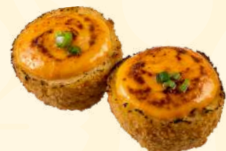
C15. DRAGON BALL MENTAI MAYO 4.8