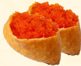
E6. INARI EBIKO