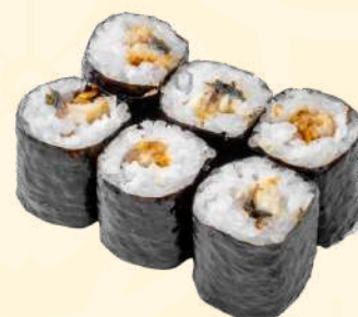
F7. UNAGI HOSOMAKI