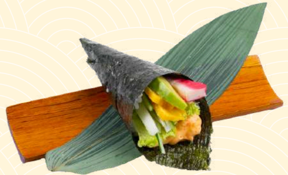
H2. California Handroll | 5.90