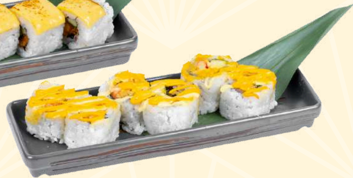
G9. Kani Tempura Cheese Maki