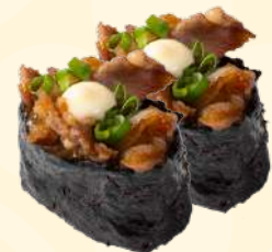
E12. BEEF TERI MAYO GUNKAN