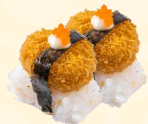
E20. FRIED SCALLOP NIGIRI