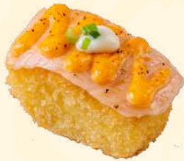
C4. SALMON ABURI MENTAI MAYO FRY NIGIRI 4.8