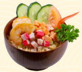
M5. Seafood Chahan | 20.90