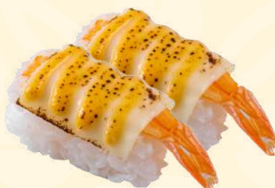
F9. EBI CHEESE NIGIRI