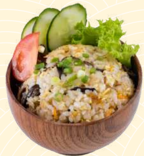
M3. Mushroom Chahan | 16.90