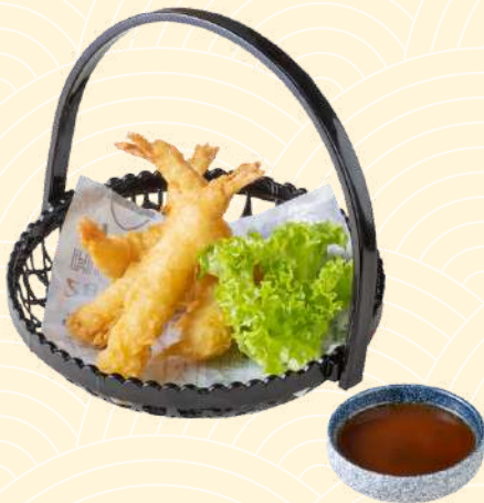
14. Ebi Tempura | 16.5