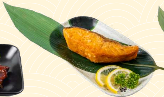
12. Salmon | 16.5 (Teriyaki/salt)