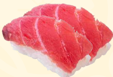
F11. MAGURO NIGIRI