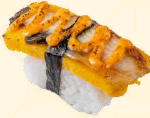
C1. UNA TAMA NIGIRI MENTAI MAYO 4.2