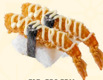
F13. EBI FRY NIGIRI