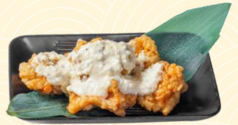
16. Chicken Nanban | 14.9