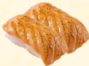
E14. SALMON ABURI NIGIRI