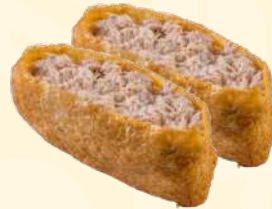
E3. INARI TUNA MAYO