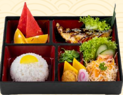
P5. Saba Bento | 24.8