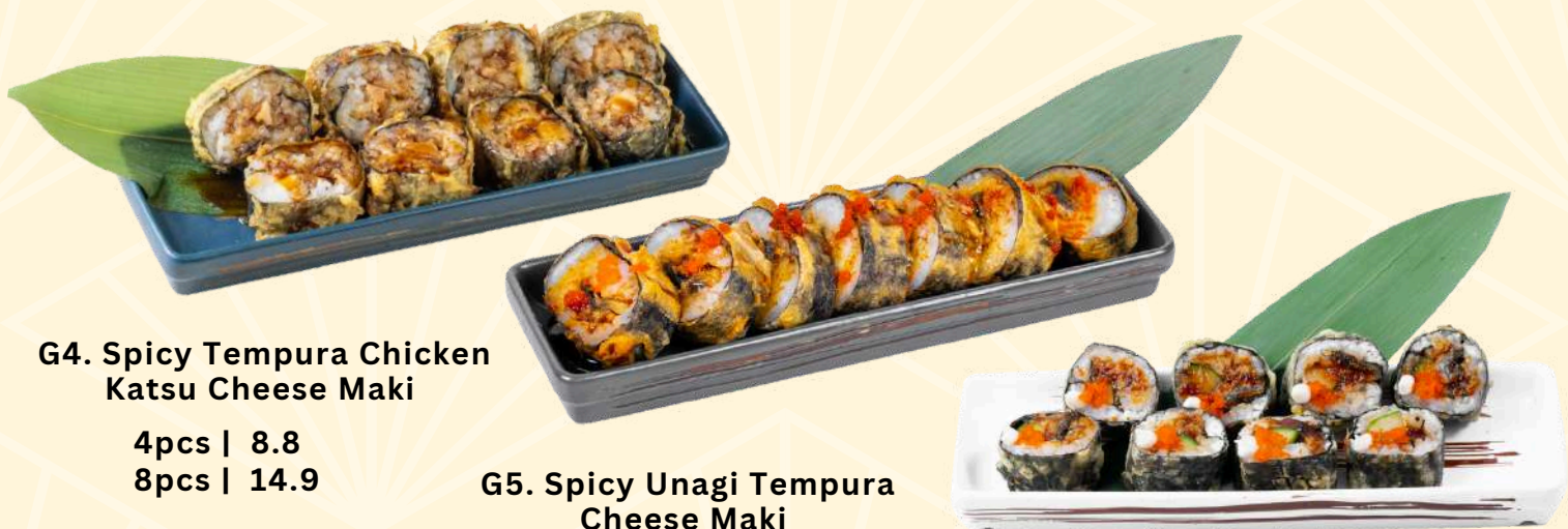
G4. Spicy Tempura Chicken Katsu Cheese Maki