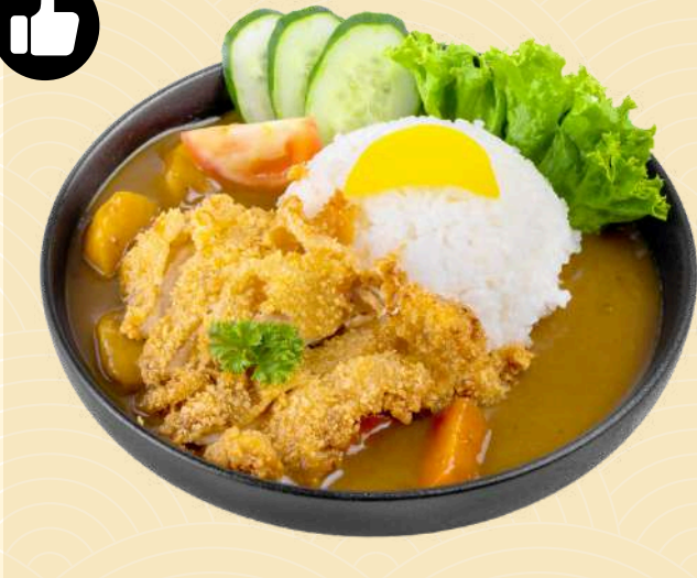
J1. Chicken Katsu Curry Don | 22.8