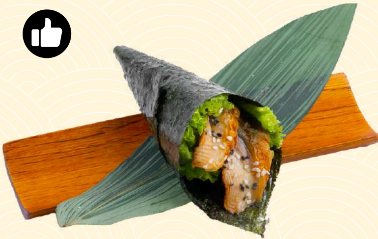
H1. Unagi Handroll | 7.80