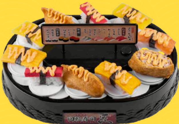
B2. Sushi Belt Mentai | 19.8