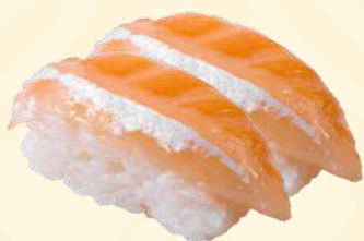
F1. SALMON BELLY NIGIRI