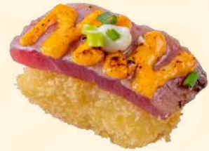
C3. TUNA ABURI MENTAI MAYO 5.2