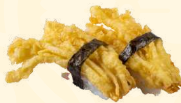
E15. ENOKI NIGIRI