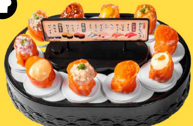
B5. Salmon Hana Sushi Belt | 38.20