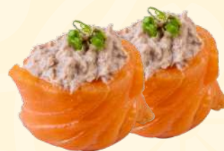
F4. SALMON HANA TUNA MAYO