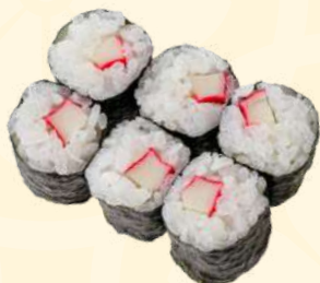
E17. KANI HOSOMAKI