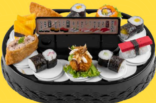
B4. Sushi Belt Mix | 18.2