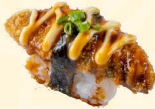
C5. CHICKEN KATSU SPICY MAYO 3.6