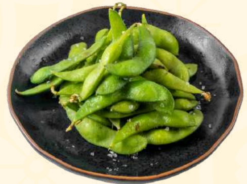
A6. Edamame | 5.80