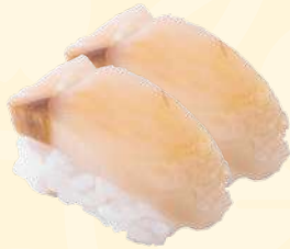
E5. WHITE TUNA NIGIRI