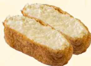
E18. INARI EGG MAYO