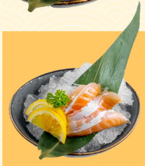
B7. Salmon Belly Sashimi