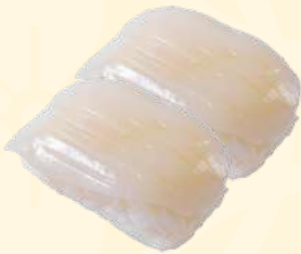
E9. IKA NIGIRI