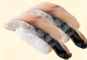
E11. SABA NIGIRI