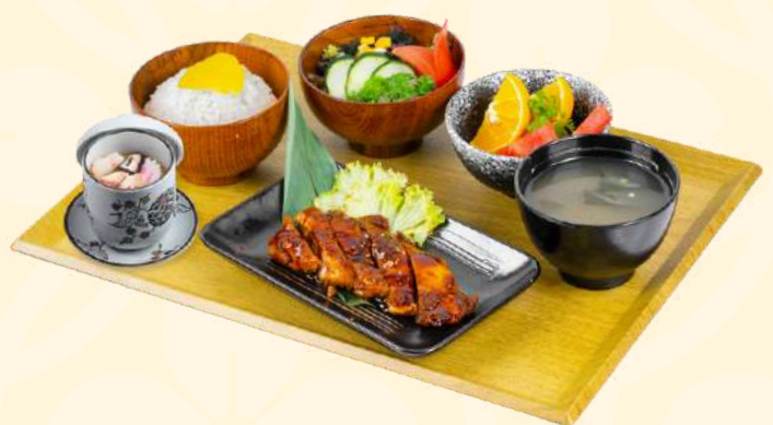
N3. Chicken Teriyaki Set | 27.2