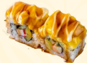
C9. LEMON MAYO MAKI 4.2