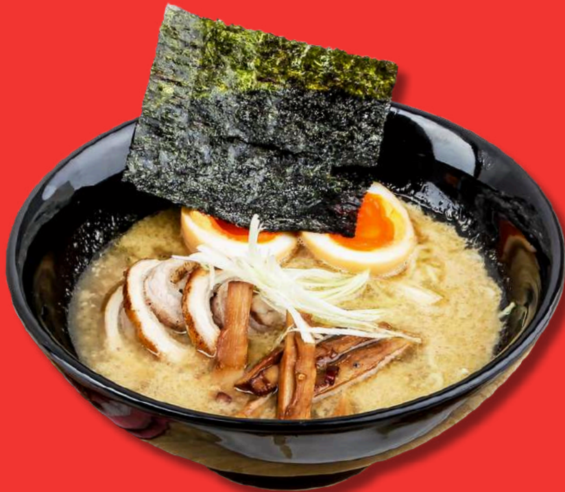
L2. TORI PAITAN MISO RM28.20 (Original/Spicy)