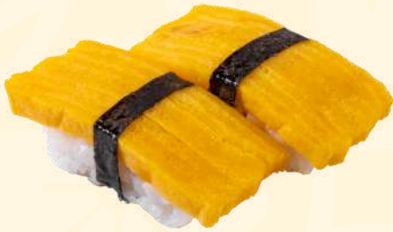
D1. TAMAGO NIGIRI