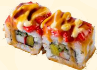
C8. ROSE MAYO MAKI 4.2