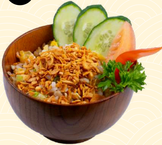
M1. Garlic Chahan | 15.90