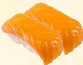
E13. SALMON NIGIRI