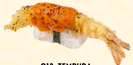
C12. TEMPURA SPICY LAVA NIGIRI 4.6