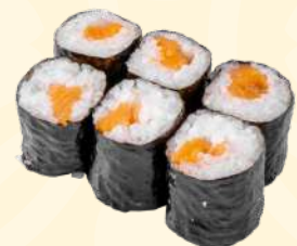
E16. SALMON HOSOMAKI