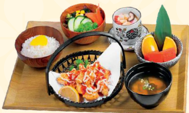
N2. Salmon Piri Piri Set | 32.8