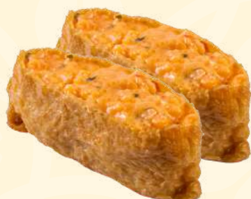
F8. INARI LOBSTER SALAD