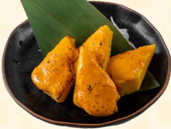
A1. Lava Sauce Atsuyaki Tamago | 7.20