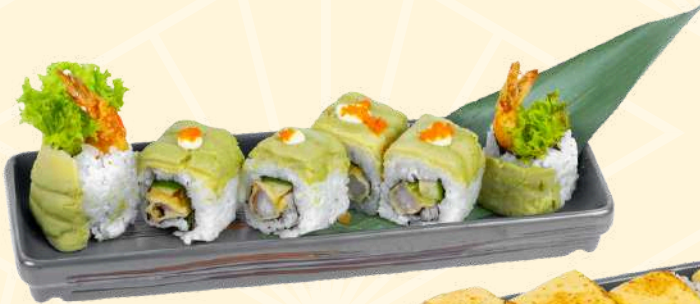
G7. Ebi Avocado Maki