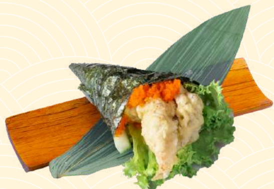
H6. Soft Shell Crab Handroll | 6.90