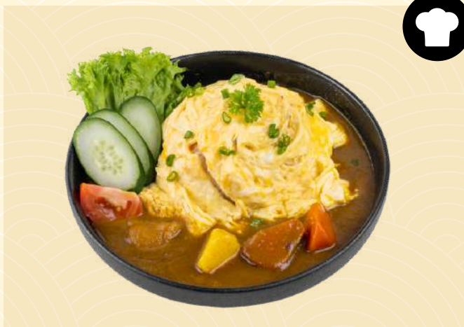
J5. Omurice Curry Don | 18 Add-on Chicken katsu | 6.8