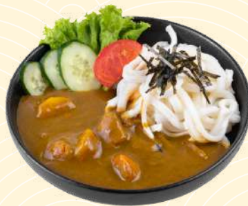
M7. Curry Udon | 19.80 Add-on katsu | 6.8