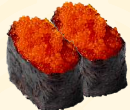
E4. EBIKO GUNKAN