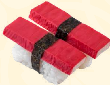
D2. KANI NIGIRI