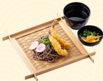
M8. Tempura Tsuke | 22.80 Soba/Green Soba/Udon