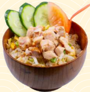
M4. Salmon Chahan | 18.50