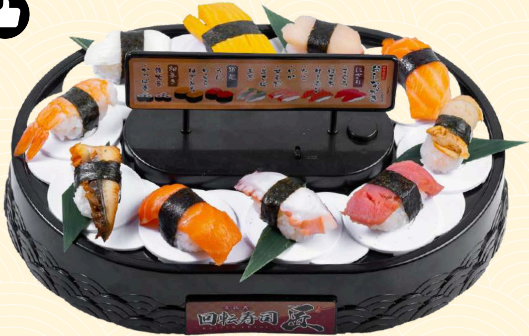
B1. Sushi Belt Set A | 28.90