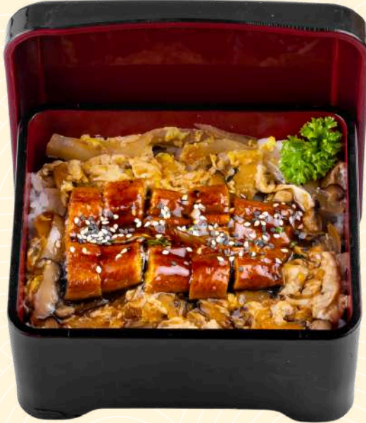
K1. Unatama Jubox | 32.8