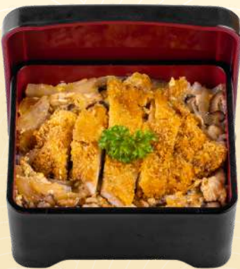
K5. Tori Katsu Jubox | 22.8