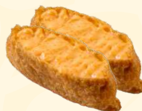
E19. INARI MENTAI MAYO