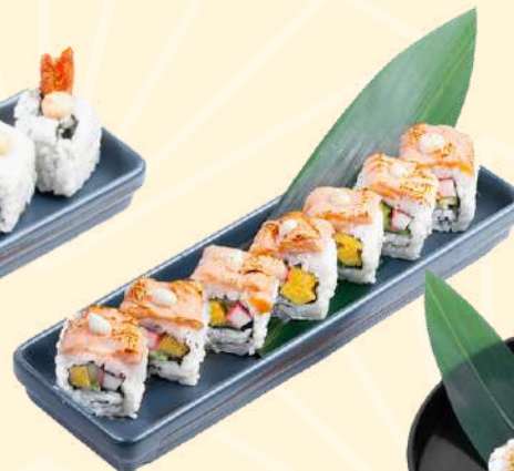
G12. Salmon Aburi Mayo Maki