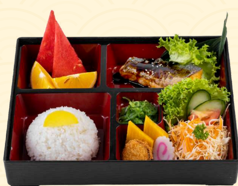
P2. Salmon Bento | 32.8