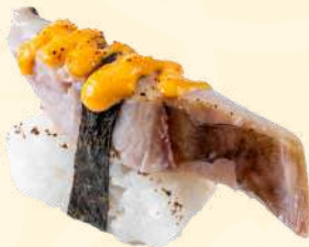
C7. SABA ABURI MENTAI MAYO 4.2