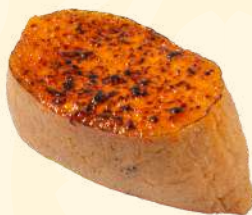
C13. INARI SPICY LAVA 3.6