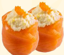
F2. SALMON HANA EGG MAYO