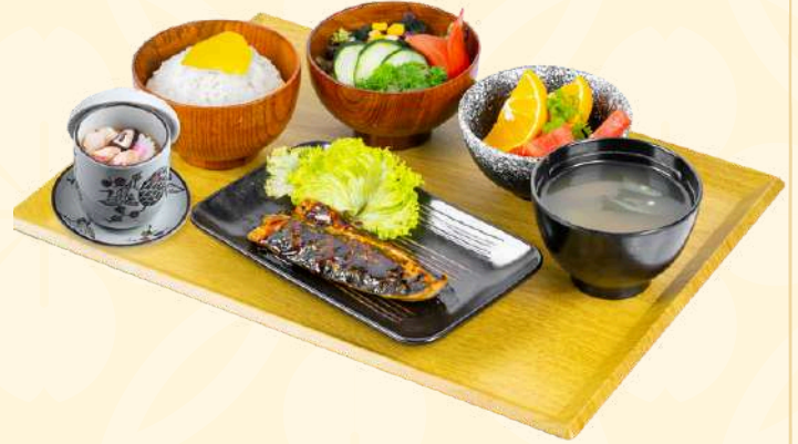
N5. Saba Teriyaki Set | 27.2