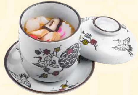
A11. Miso Soup | 4.50 A12. Clams Miso Soup | 6.80 A13. Chawanmushi | 5.80