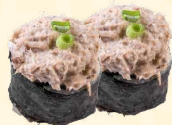
D12. TUNA MAKI