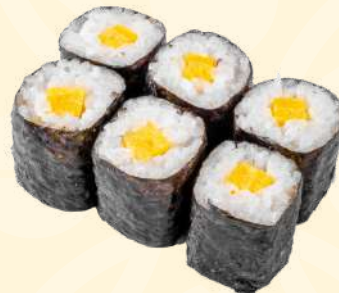
D8. TAMAGO HOSOMAKI