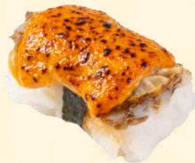
C11. HOTATE SPICY LAVA NIGIRI 4.2