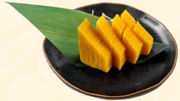
A2. Atsuyaki Tamago | 5.20