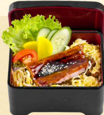
K3. Unagi Jubox | 29.8