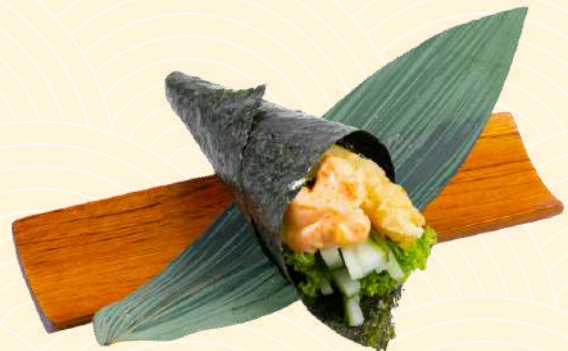
H4. Ebi Tempura Handroll | 5.90