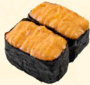
D6. MENTAI MAYO GUNKAN