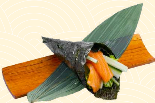
H5. Salmon Handroll | 6.90