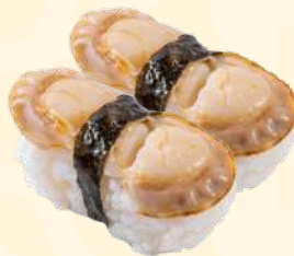
E10. HOTATE NIGIRI