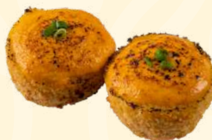
C14. DRAGON BALL SPICY LAVA SAUCE 4.8