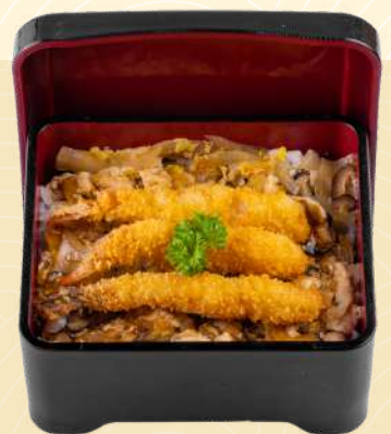
K7. Ebi Fry Jubox (4 pcs) | 24.8