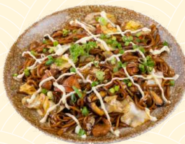
M9. Yaki Soba | 18.90