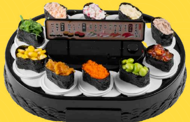
B3. Sushi Belt Gunkan | 18.2