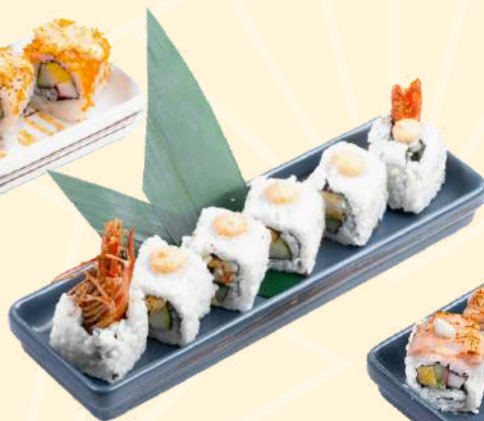
G11. King Prawn Mentai Mayo Maki