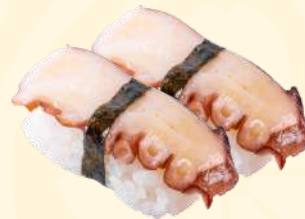
E7. TAKO NIGIRI