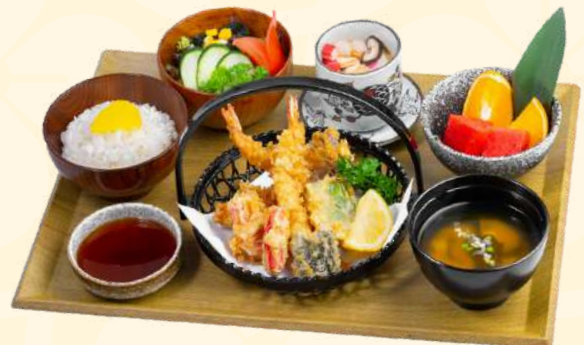
N9. Tempura Mori Set | 29.8