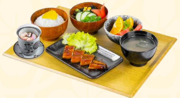
N7. Unagi Set | 36.8