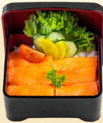
K6. Salmon Sashimi Jubox | 29.8