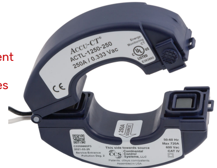
Split-Core Current Transformer, ACT-1250 Series