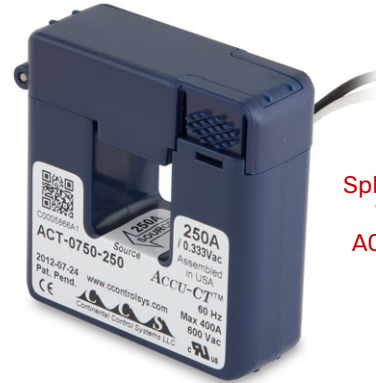
Split-Core Current Transformer, ACT-0750 Series