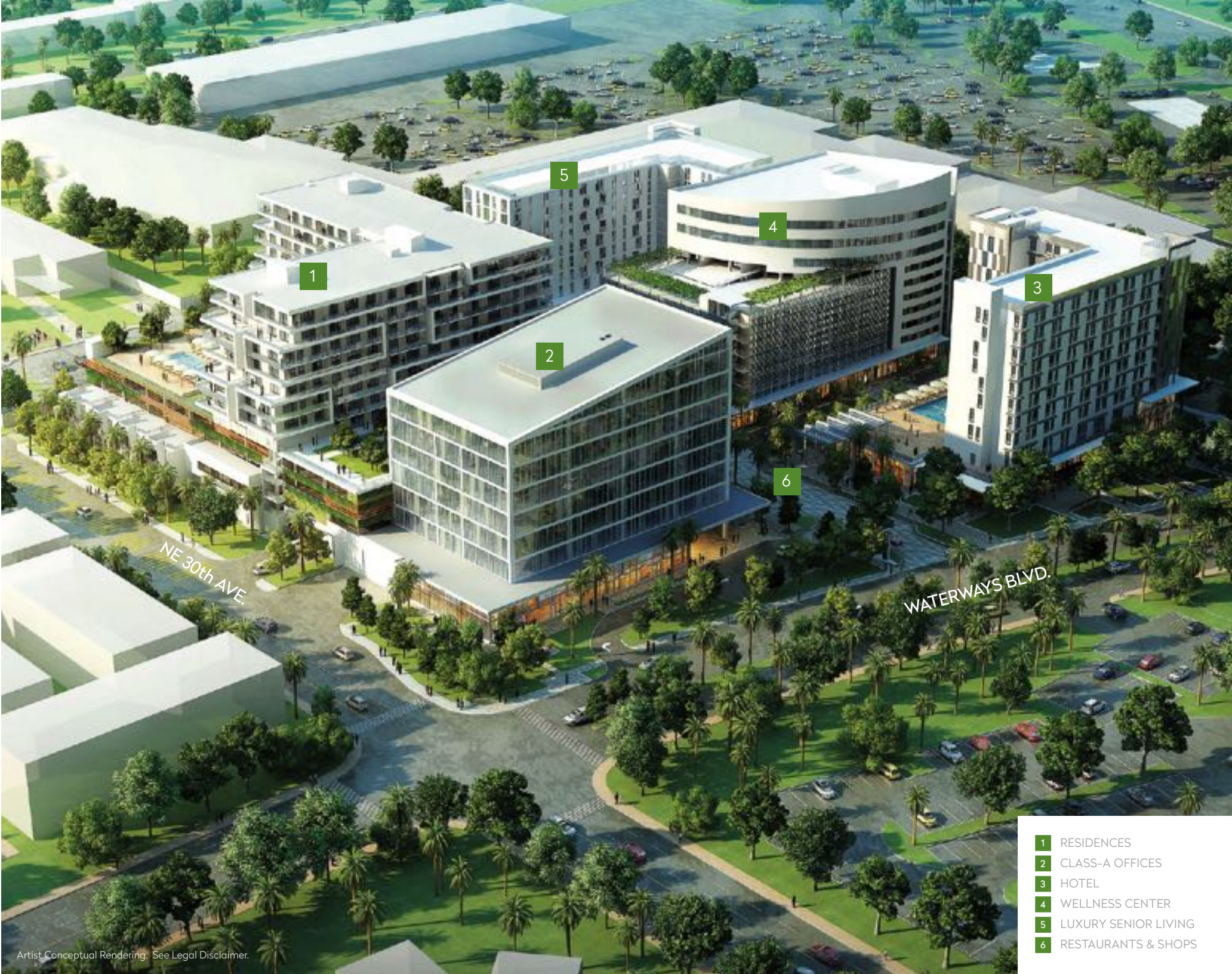
Artist Conceptual Rendering. See Legal Disclaimer.