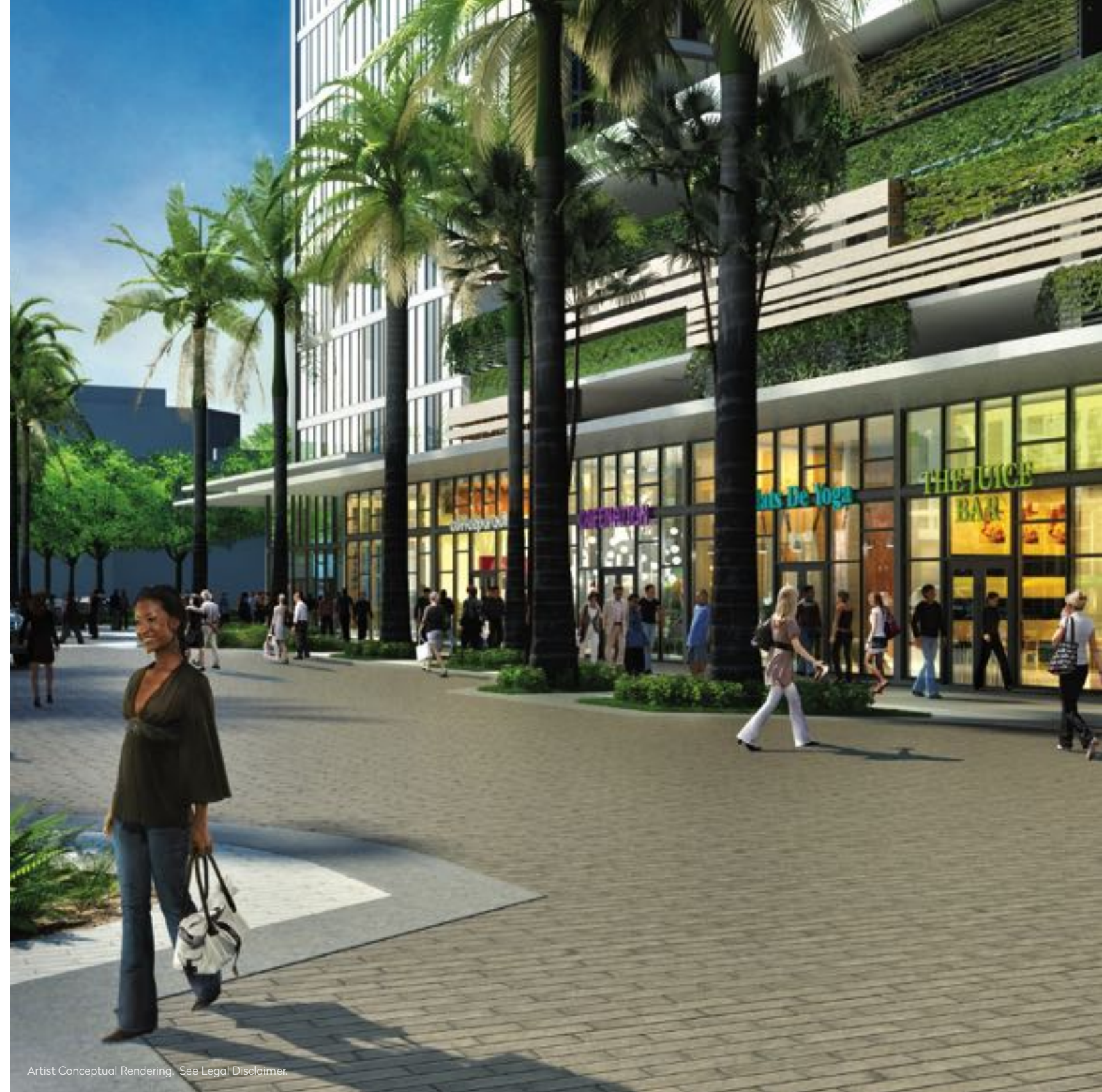
Artist Conceptual Rendering. See Legal Disclaimer.