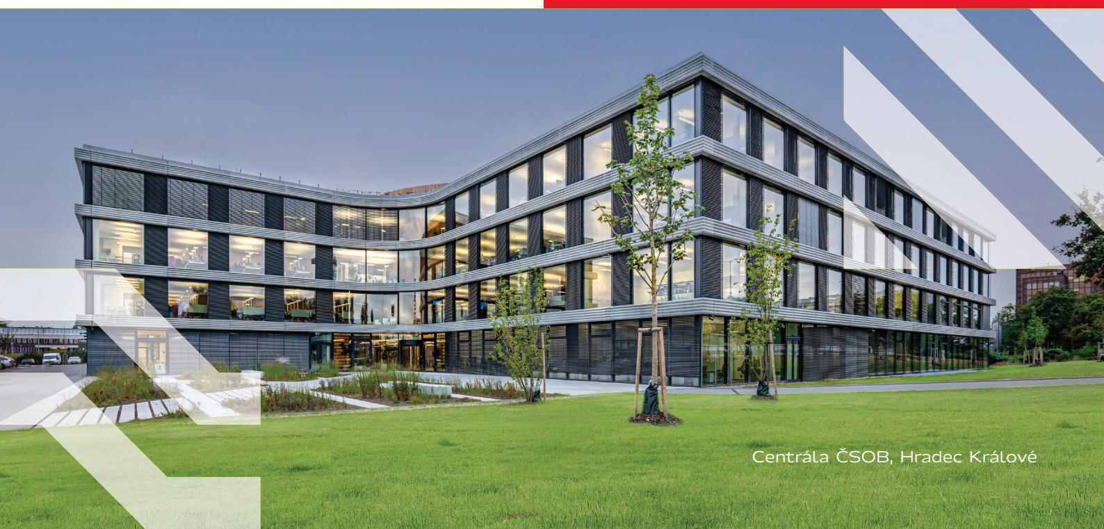
Centrála ČSOB, Hradec Králové