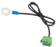
Connector with preassembled DC minus cable (included)

The BatteryProtect disconnects the battery from non essential loads before it is completely discharged (which would damage the battery) or before it has insufficient power left to crank the engine.