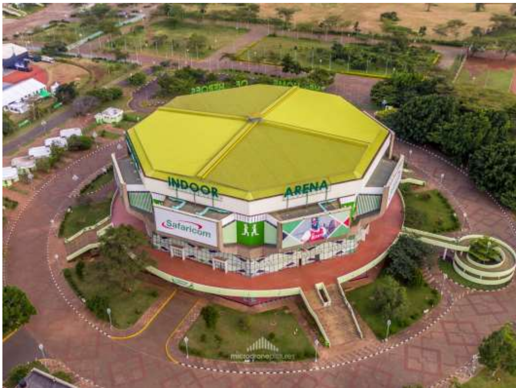
Safaricom Indoor Arena – The Home of Heroes

The venue shall be, Moi International Sports Centre (MISC), Kasarani with the actual competition taking place inside the state of the art Safaricom Indoor Arena , with a seating capacity of 5,000 people.